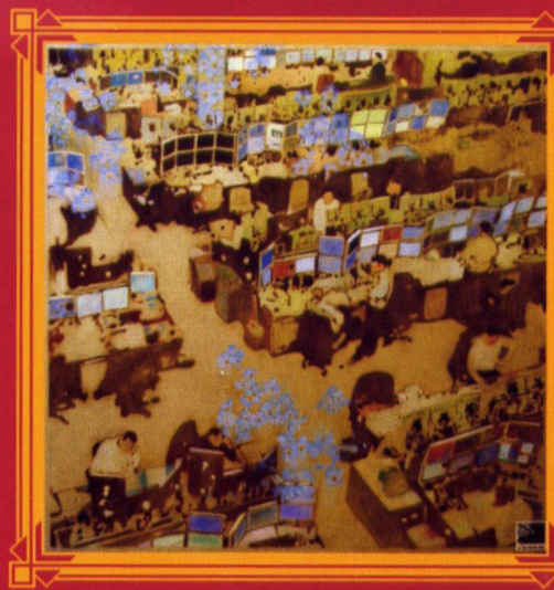
Margarita Gluzberg. In The Blackout. Oil on linen canvas. 160 cms x 160 cms. 2008.