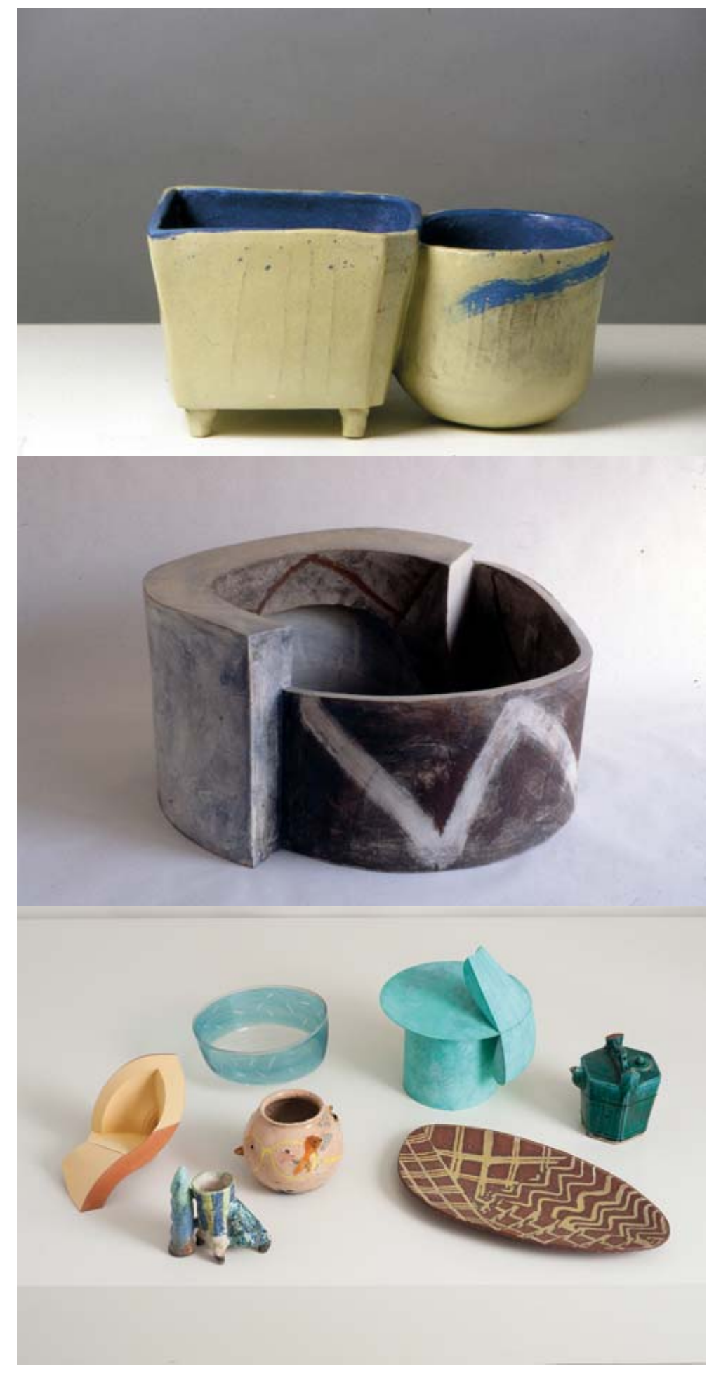
From top to bottom: Alison Britton, Trough, 2001