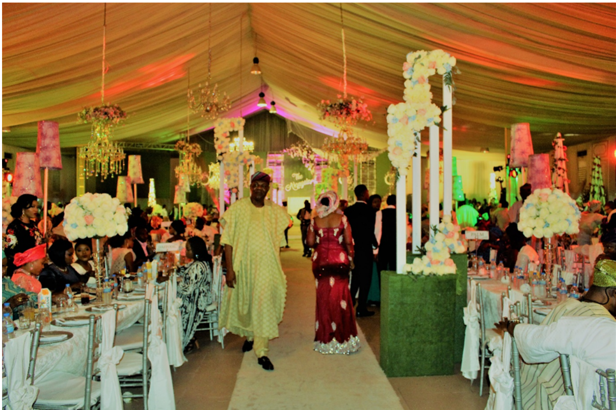
Fig. 39. Opulent decor at a 'small' reception in Lagos.