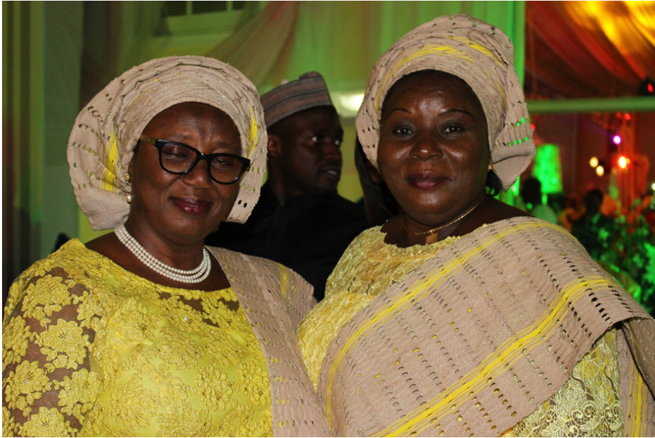
Fig. 36. The Yesufu sisters in ó ñjá'wù sányán așò òkè with yellow stripe.