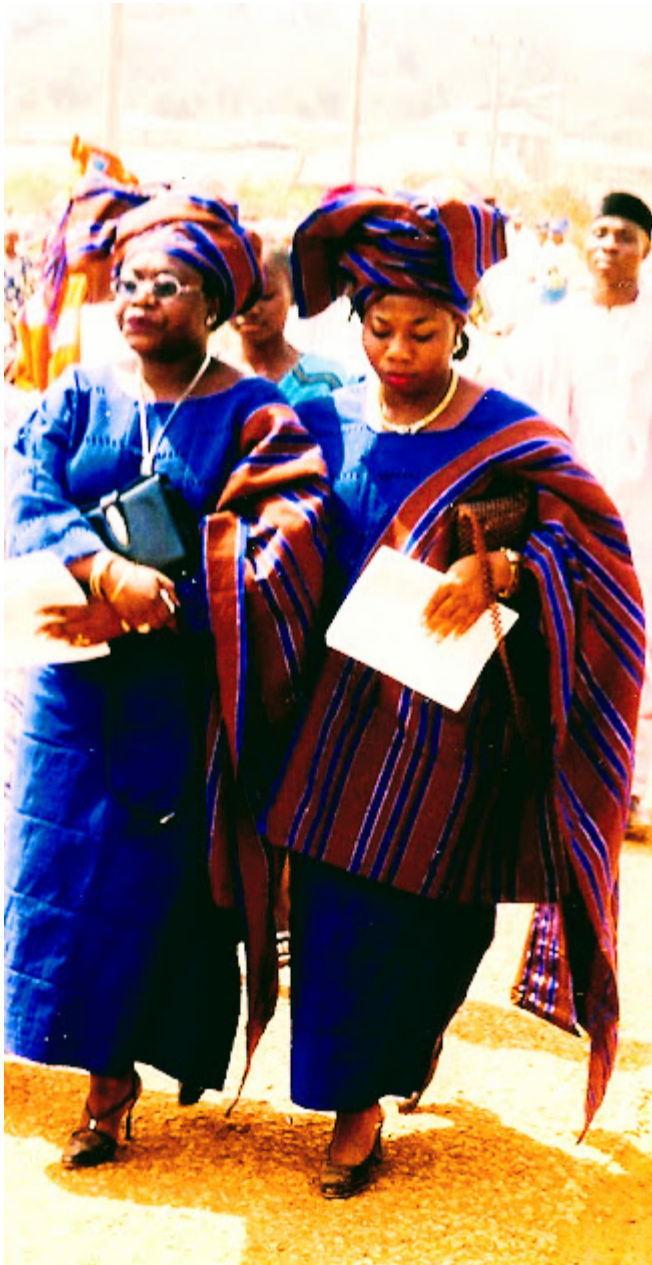
Fig. 37. Full aṣọ òkè aṣọ ẹbí 'completes'