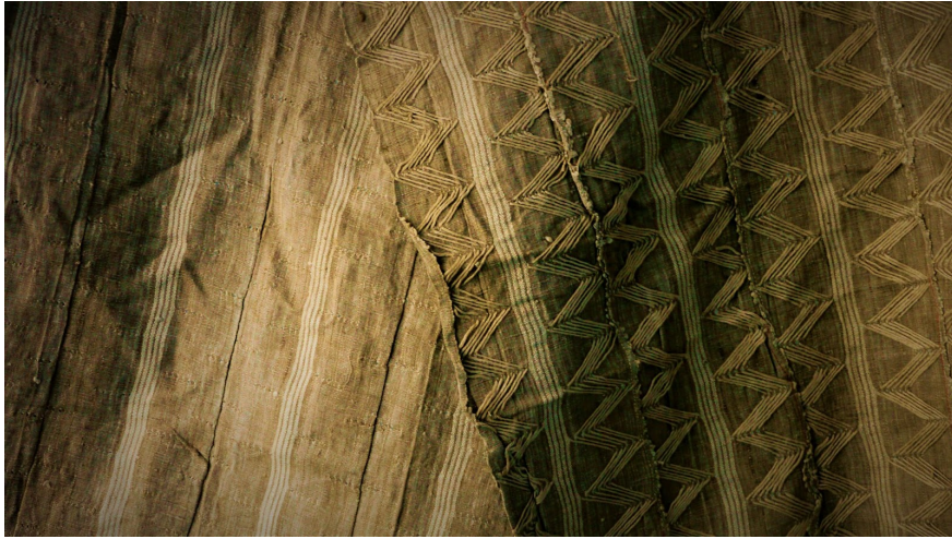
Fig.31. Vintage sányán, embroidered with silk thread. Over 100 year old heirloom cloth from researcher's collection