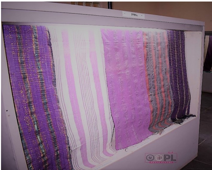
Fig. 29 and 30. așò òkè exhibits from the 1960s and 1990s. Ogunsheye Collection, Olusegun Obasanjo Presidential Library.