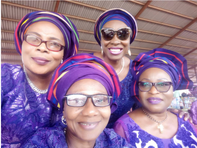
Fig. 43. St. Anne's School, Ibadan alumni at a reunion event wearing the school aso òkè aso egbé . Although not technically aso ebi , the two concepts have become conflated and aso ebi , as a term, serves for both. Ibadan, 2020.