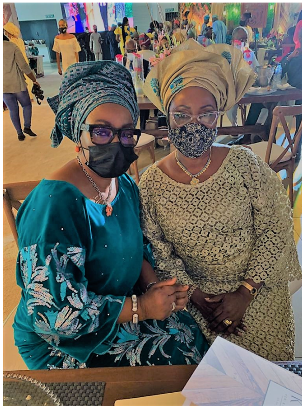
Fig.44 -48. An array of post-COVID sartorial adaptations to accommodate the pursuit of resplendence.