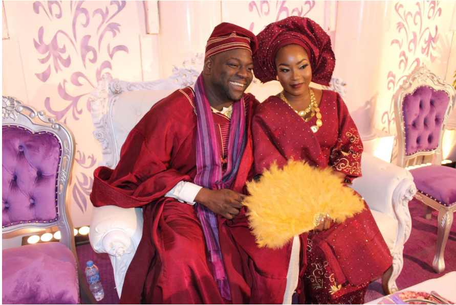
Fig.38. Bride and groom wearing contemporary Àlárí. The bride's aṣọ òkè has been heavily embroidered in gold thread and studded with diamanté. The groom has an heirloom vintage Àlárí stole around his neck in memory of his late father.