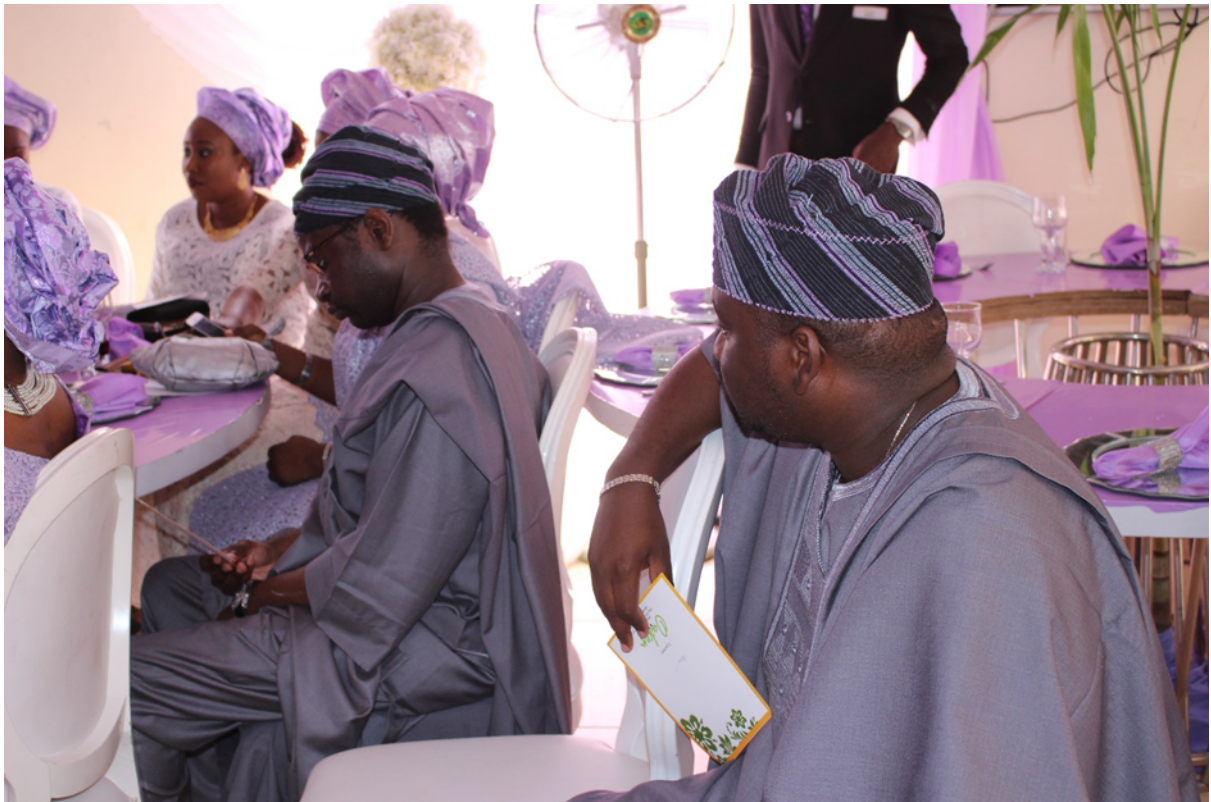
Fig. 42. At the same traditional wedding ceremony. Two men in their light-weight wool agbada and the aşo ẹbí aşo òkè fila.