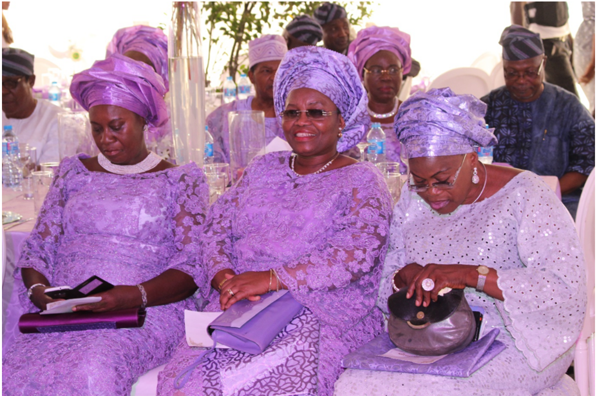
Fig.41. Guests at a traditional wedding reception. The colour code was silver and lilac. The gele although not aşo òkè , was aşo ẹbí . The men's fila was both aşo òkè and aşo ẹbí . Lagos Island.