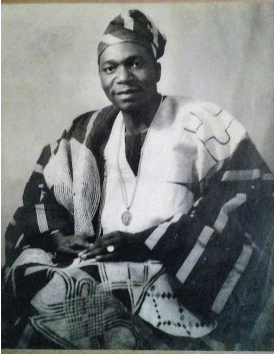
Fig. 33. Researcher's father wearing Àláári with sányán stripes, 1950s Lagos.