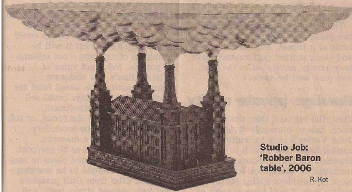
Studio Job: 'Robber Baron table', 2006