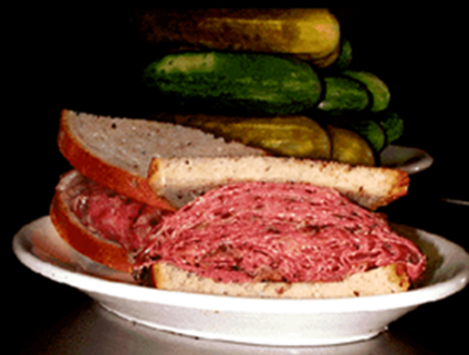
and orders a pastrami on rye with a pickle on the side to go.