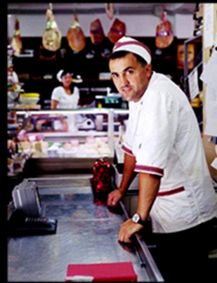
He realizes though that he's been staring, and apologizes...