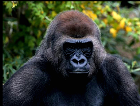
"You keep charging twelve bucks for a sandwich," says the gorilla, "and you never will again."