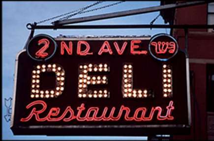
A gorilla walks into a deli in New York,