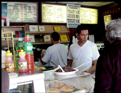
"Uh, I'm sorry sir, but to be honest with you, I've never seen a gorilla in here before."