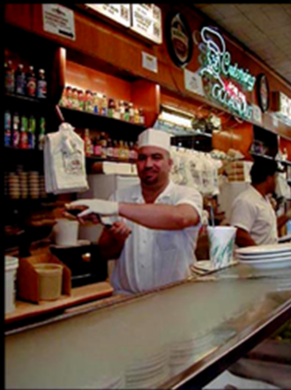
The guy behind the counter puts the sandwich together and when its ready says: "That'll be twelve dollars."