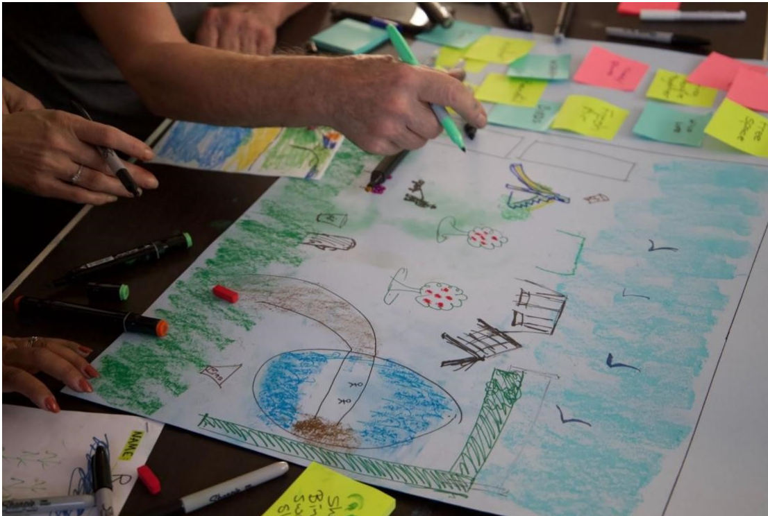
Figure 3: Participants are working collaboratively to envision their ideal nature space and sharing their thoughts about why these are important to them