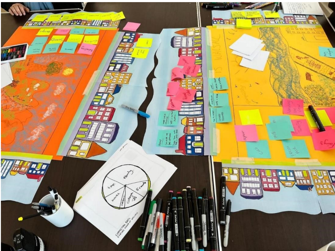
Figure 4: The participants considering the ideal nature space in the context of community and discussing what is needed to enable this future vision to happen