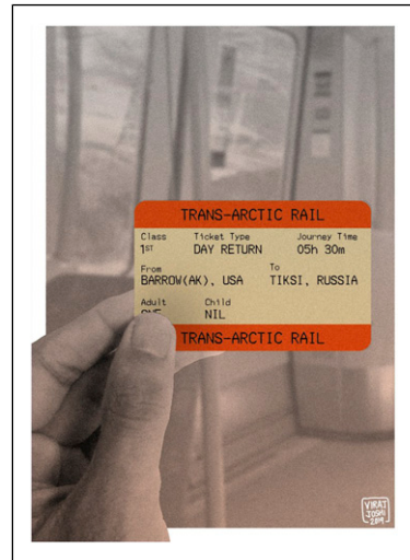
Image 4. ‘The Trans-Arctic Rail Ticket’ by Viraj Joshi [02]. Postcards from the Future no. 01. With climate change looming over us, most of the Arctic ice will melt by the year 2030. Countries around the Arctic Circle have already started talking about a new ‘Arctic Silk Route’ to make trading easier, cheaper, and faster. Profitability utopia/environmental dystopia.

own behaviour, to help us as individuals and professionals to head into a preferred future, or indeed away from an unfavourable one. In ‘Posthumous Conversations’, Nadia and I took the idea of big-tech owning our data farther, in order to make a tongue-and-cheek provocation.