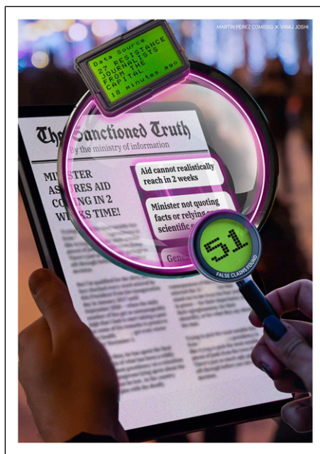
Image 1. 'Deglitcher' by Martín Perez Comisso and Viraj Joshi [02]. Postcards from the Future no. 33. When sources of truth are sanctioned and controlled by the state, deciphering the truth becomes the responsibility of buggy, malware-like niche software, all developed underground. The 'deglitcher' is a tool for those who dare to find decentralised, documented truths. With this device, someone can compare the observed information with 'deep archives', to avoid being fooled by uncontrolled algorithms, deep fakes, or even the victorious stories of the government of the day.

In other words, we could very well use speculation as a test bed for uncertain scenarios. This can then be used to inform our