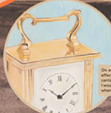
On a wooden shelf above a plug in the dining room, a brass carriage clock with a grating lock on top that would open if the cabinet under the stairs when home alone.