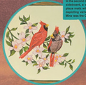
In the second drawer to the left of the wardrobe, a set of four Lark Larkwood plates made with hand-painted, hand-drawn designs of garden birds. What were the Cardinal Peck?