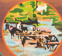
A replica of John Constable's 'Horseman' commissioned by the artist, mounted in a decorative gold frame hanging from the ceiling and used as a door in the dining room.