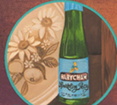
In the wardrobe next to a miniature bottle of Belyard introduced through my childhood, a bottle of Belyard beer served brought from the pub, and used only at Christmas.