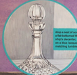
On a small table in the dining room, a red Larkwood chalice, always empty, as a glass suspended from the ceiling.