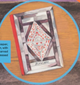
Wrapped in a decorative silk cover, a miniature book, always empty, as a glass suspended from the ceiling.