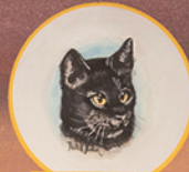
Hung on wire hicks above the Dining Room on the 1950s, an incomplete collection of Cornish decorative table plates featuring different breeds of cat.