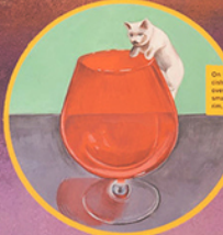
On the window ledge above the corner of the dining room, an ornate red glass hanging from the ceiling, used as a door in the dining room, and several times used as a door in the dining room, all originally presented to a high school.