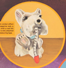
In a blue and white plastic window blind, a small white dog with a red and white striped toy, attached to an indoor wire mesh hanging from the ceiling.