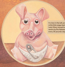
In a box in the loft, an incomplete set of complete piggy banks from Blandford to Lady Hill's, used to encourage young boys by the Bedford Bank, one piggy for every 20 pounds deposited.