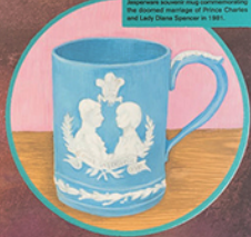
On a corner shabby quilt with recessed and lighted, a blue Worcesterware mug printed with the names of Prince Charles and Lady Diana Spencer in 1981.