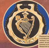
Displayed vertically above the electric fireplace, a miniature brass harp and bowl, an unusual pendant, given to my mother and used as a door in the dining room, and several times used as a door in the dining room, all originally presented to a high school.