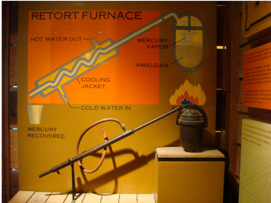
FIGURE 1 Iron retort, Sutter's Mill display.

United States Geological Survey recently surveyed the biota and sediments across California's Bear and Yuba watersheds, subsequently publishing fish consumption advisory figures in an attempt to counter excessive methylmercury bioaccumulation in the watershed's human population. 34 Signs now appearing at water courses across California state the situation more bluntly: PROTECT YOUR HEALTH – DON'T EAT THE FISH CAUGHT HERE. 35 Government agencies have also made landscape interventions to reduce mercury dispersal from contamination hotspots in the Bear-Yuba watershed, including building dams to slow the spread of contaminated sediments. But the dams cannot reduce the underlying level of methylmercury, and these remediation attempts are now being compromised by variations in California's weather patterns. These include flash floods that churn and wash out the heavily contaminated sediments. 36