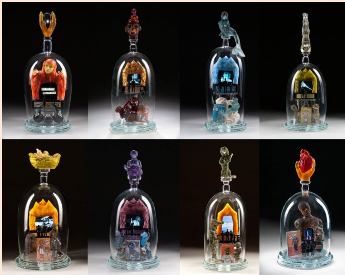
Figure 1: Tate's Sideshows - explicit demonstration of congruent digital shadows.

One of the enduring propositions of technology futures is the crafting of material artefacts with Internet connectivity, allowing for the embodiment of a congruent digital shadow as exemplified in Figure 1.