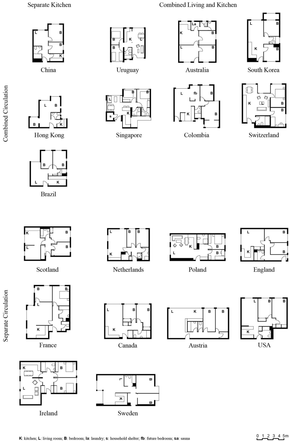
Figure 2. Typical two-bedroom dwelling plans organized according to different design strategies (separate/combined kitchens or corridors). Differences in size and organization indicate layout efficiency strategies (combined kitchens and corridors producing smaller dwellings than separate kitchens and corridors) and different conceptualizations of home use and users.