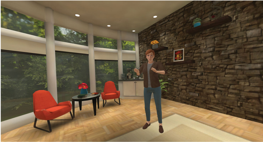
Figure 8. The coach in the coach's room.

A series of paper and electronic prototypes were made for people to record and reflect on the session, and write their plans for in-between sessions. A questionnaire showing these designs was sent to the LEAP for feedback and refinement.