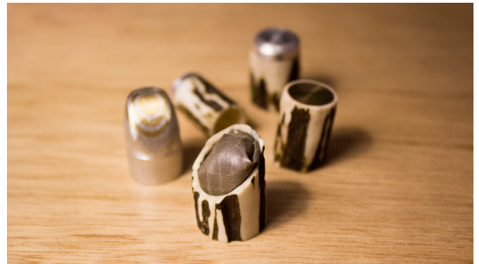
Figure 1. Sketch (a) above showing the design of the thimble consisting of two essential parts, a rigid cylindrical base, and a thin conductive fabric for the finger tip. Photo (b) below showing a number of thimbles resulting from exploring suitable materials, with the front thimble showing a rigid base made from antler combined with a grey conductive fabric tip.

as well as functional, design. For example, considering the potential for personalised touchscreen thimbles , not just for accurate sizing, but also for custom styling. An innovation through tradition design approach, which enables connecting new technology with familiar traditions (e.g. textiles) could be helpful in determining desirable aesthetics for the adoption of touchscreen thimbles .