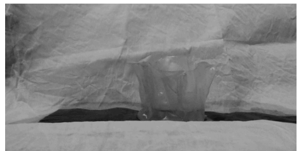
Figure 5: 'Waiting by Water' Debbie Poon