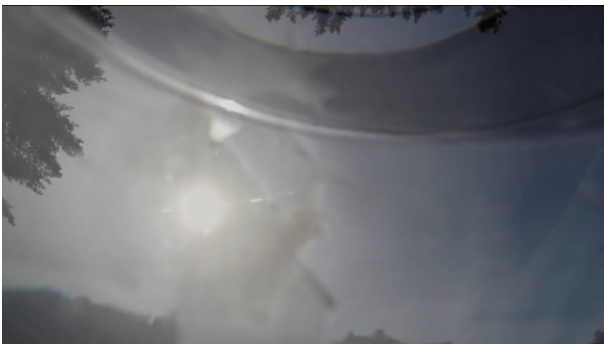
Figure 2: 'Water.' Corinne Duchesne