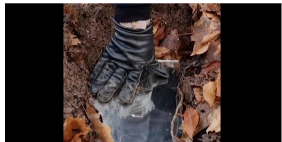
Figure 6: 'Performance with mirror for Trees' Irene Loughlin