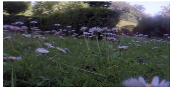
Figure 3: 'Nature' Cristina Portugal