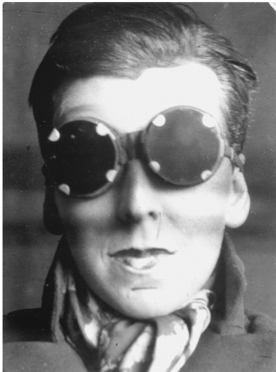
Claude Cahun, Self-Portrait , 1929

*(RR) indicates you can find this text in the reading room