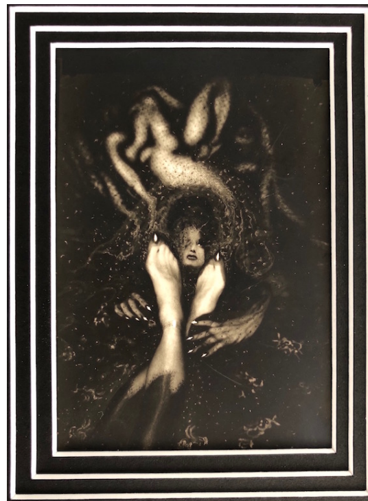
Pierre Molinier, Rêve – Les pieds amoureux , 1968