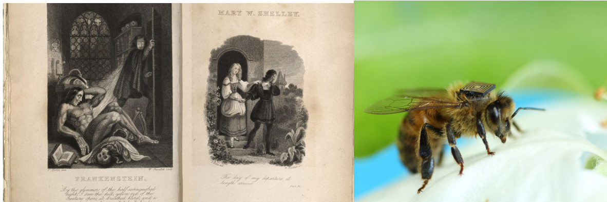
The opening page of Mary Shelley's 'The Modern Prometheus'