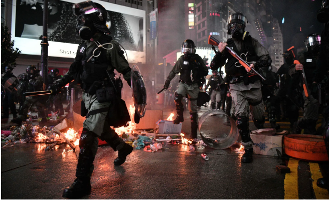
September 2019

Two Thirds Wild Imagination, Three Fifths Logic of Sense and Nineteen Twentieths Courage of Quantum.