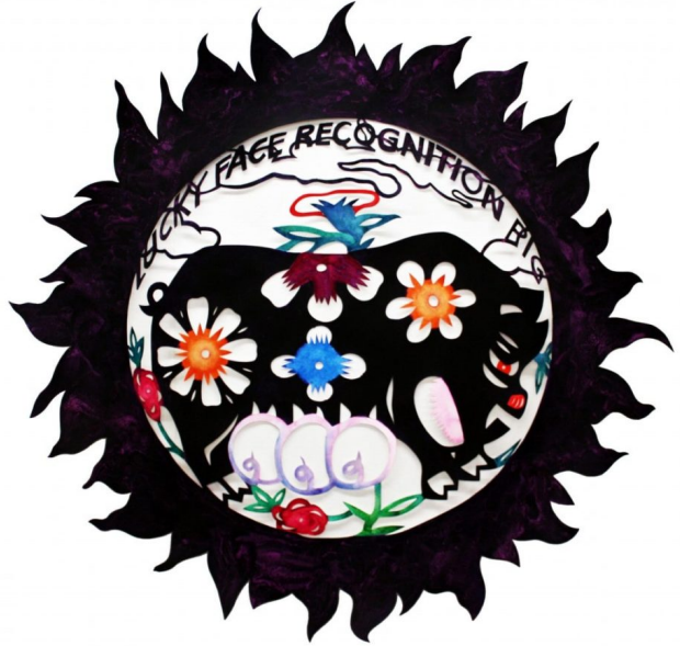
David Burrows, Lucky Face Recognition Pig, 201 Watercolour, acrylic and varnish on paper