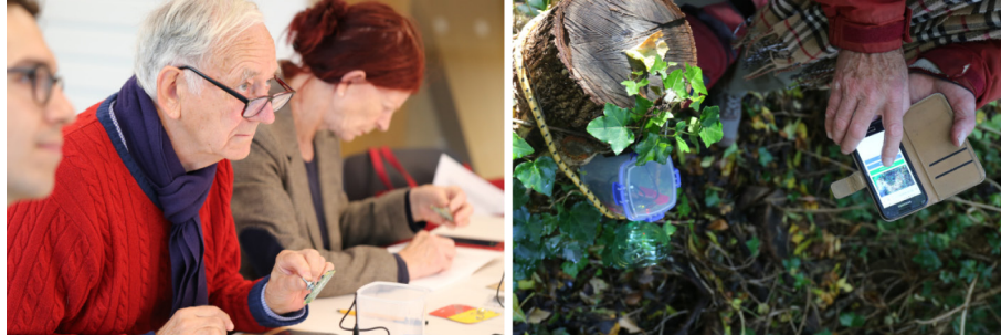
Fig. 3. Assembly and deployment of Mynaturewatch cameras, over 60's tech group.