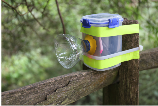
Fig. 1. A Mynaturewatch camera deployed before a workshop at Wakehurst Place.

In parallel research Hecker et al state “research in citizen science takes a diverse approach where the balance between scientific, educational, societal and policy goals varies across projects” [57]. The authors noted, “a major obstacle [in] preventing the adoption of technologies is the presence of those entrenched in traditional solutions” the Mynaturewatch advantages do not compete with traditional methods, but advance them [58]. Participants early images were evocative, but they often deleted them feeling unworthy, personally comparing to project partner BBC Earth pictures.