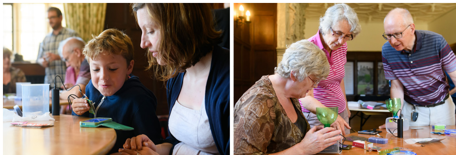
Fig. 2. Mynaturewatch Wakehurst Place workshops.

“The beauty of the project is that technology usually makes kids stay indoors and not explore the outside world, the combination is powerful” ( host comment ).