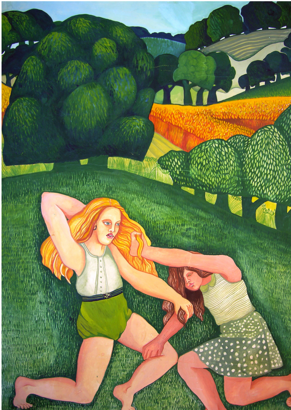
Figure 4 Howeson, Anne (1966) Two Girls Fighting , 50 cm x 35 cm gouache

An important early influence was Pieter Bruegel the Elder (1525-1569). There's a darkness as well as sense of energy and life in his paintings, and the golden idealised landscapes, teeming with people toiling in fields or dancing, drinking and eating seem to contradict the severity of the people's lives depicted within them.