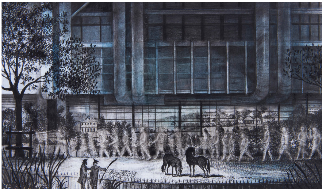
Figure 12 Howeson, Anne (2014) Hampstead Horses

In the original prints, I discovered in archives for 'Present in the Past,' people were strolling with their dogs in parks and churchyards, men digging graves, workmen building railways. Soon my drawings began to include people too. Part document, part fiction, the drawings slowly developed, becoming a kind of 'conversation' with an earlier artist. As I drew on top of their drawings, almost walking in their footsteps, new stories blended with the old - the ghosts of past communities meeting people from the streets of today.