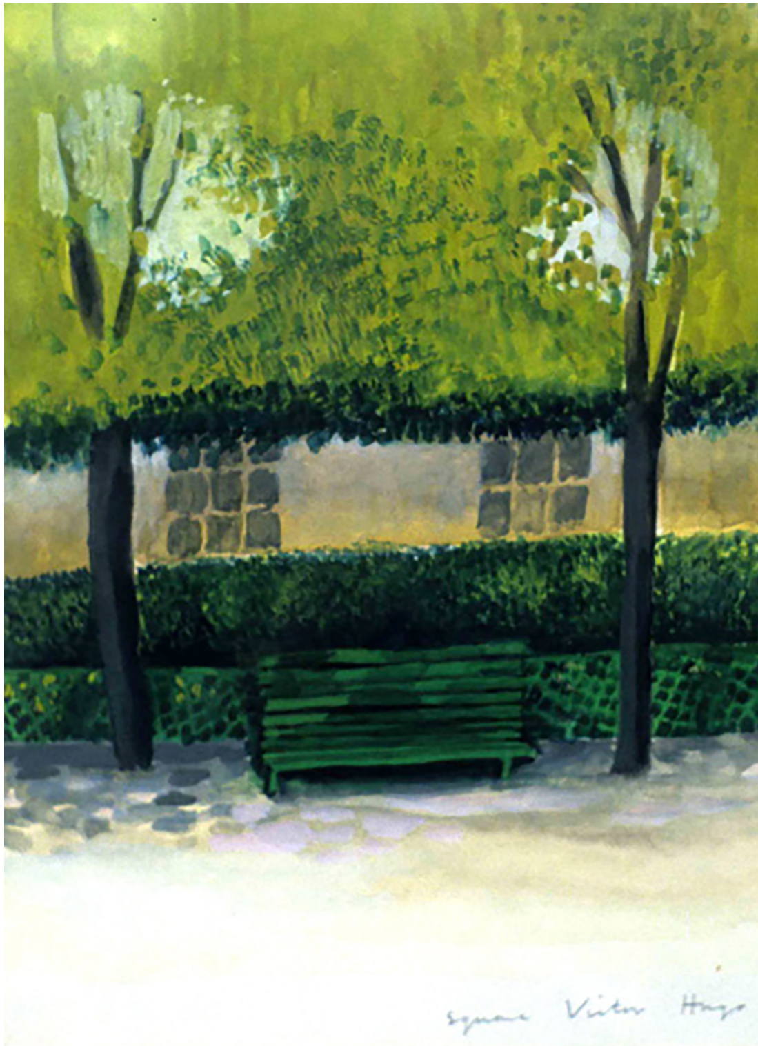
Figure 7 Howeson, Anne (1976) Paris memory gouache 18 cm x 23 cm

My first experiments with 'memory' drawings began at that time. Back in the apartment after roaming the city, I'd recall from memory the images seen on the streets of Paris during the day. They seemed to project onto my mind like glowing tableaux: a little solitary bench in the corner of a dusty square, a single lit window at the top of a high building along the River Seine, with the moon appearing above its roof behind clouds. The atmospheric lighting along