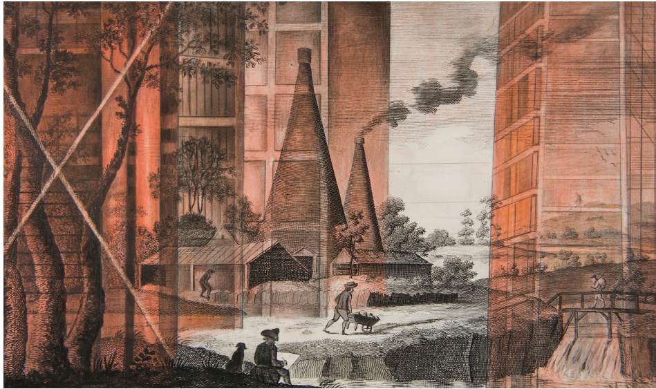
Figure 13 Howeson, Anne (2014) Tile Kilns

Place and space have a special relationship with memory and time in my work because architecture and landscape represent lived experience. People have always walked into rooms, across fields and forests and through the built environment. An awareness of past lives can be sensed everywhere in the layers under our feet, offering narratives, themes of loss, connection and renewal - rich material for new creative projects.