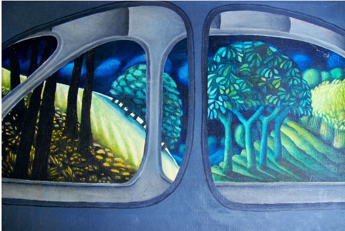
Figure 5 Howeson, Anne (1968) Car Journey 25cm x 35cm oil on canvas

Looking back, I realise the rural settings where I lived until the age of nineteen informed my whole future artistic world. As a child I wrote about the trees, fields and sky outside our windows and made drawings of the landscape near our house, including a triptych about a car journey.