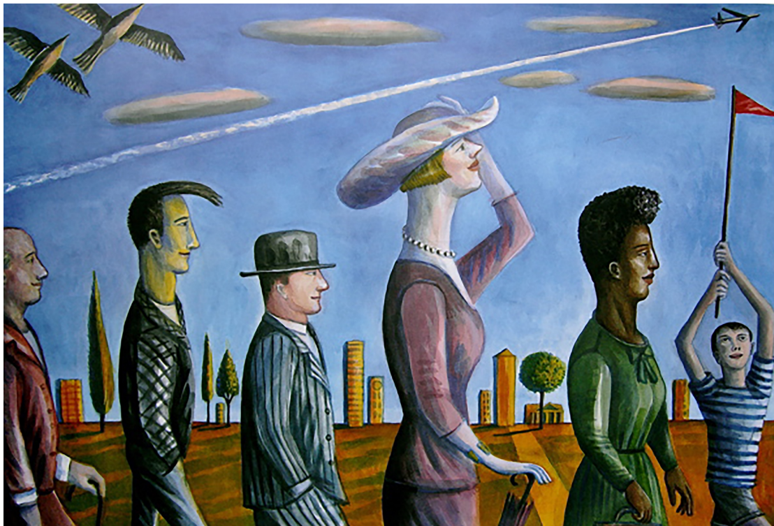
Figure 6 Howeson, Anne (1994), Freedom for the Individual , 500 x 400 cm gouache

because the figure behind the tall woman in the middle turned out to be a portrait of my future husband. I did not meet him until the following year.