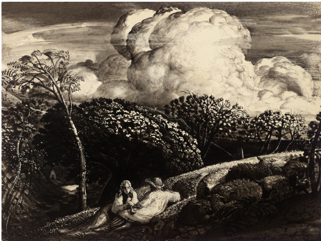
Figure 1 Palmer, Samuel (1833-34) The Bright Cloud ink and watercolour 22.9 cm x 30.5 cm, image reproduced with permission

The rural countryside near the North Downs in Kent was my first home. It was a place of tranquility and calm. Samuel Palmer lived in the nearby village of Shoreham in the early nineteenth century, his visionary and mystical first paintings influenced my own early work