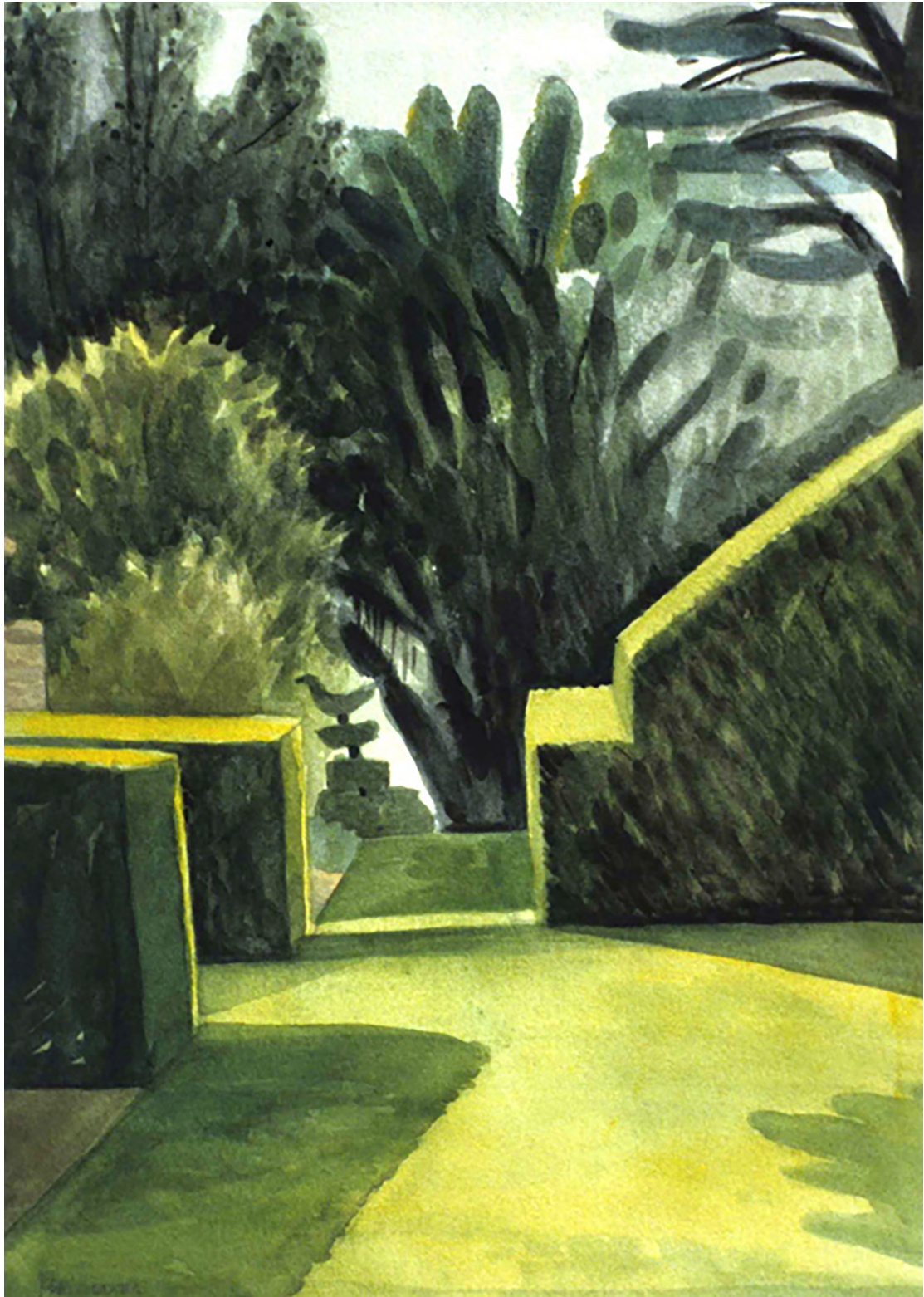
Figure 9: Howeson, Anne (2000) Garden gouache 290 x 410 cm

Perhaps early memories of Capability Brown's landscape created my interest in formal gardens. Mysterious and atmospheric with their clipped topiary hedges, it is wonderful to experience them on hot summer days when the long dark shadows transform them into stage sets.