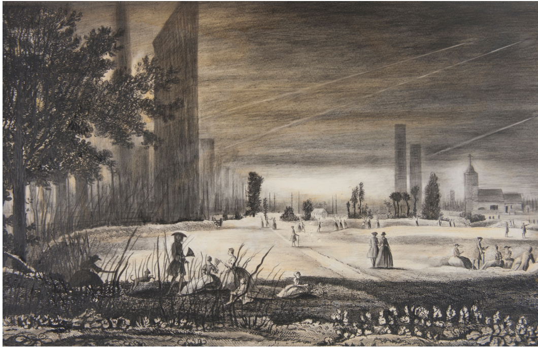
Figure 11 Howeson, Anne (2014) St Pancras in the Fields 1752

In the original prints, I discovered in archives for 'Present in the Past,' people were strolling with their dogs in parks and churchyards, men digging graves, workmen building railways. Soon my drawings began to include people too. Part document, part fiction, the drawings slowly developed, becoming a kind of 'conversation' with an earlier artist. As I drew on top of their drawings, almost walking in their footsteps, new stories blended with the old - the ghosts of past communities meeting people from the streets of today.