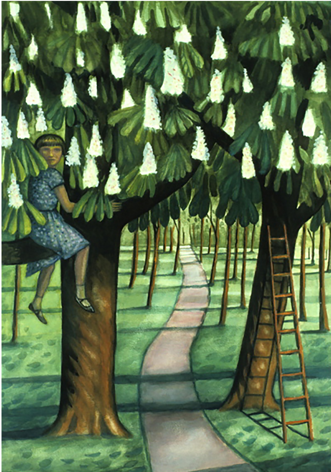
Figure 2 Howeson, Anne (1993) Chestnut tree gouache 60 cm x 40 cm

ha wall (a quirky kind of wall which takes a step down and forms a boundary between an estate's gardens and grounds, giving a clear view over a landscape and stopping the cows from getting in, without the need of a fence). Copses of trees were planted on the brow of rolling hills, cutting into the existing landscape like a huge drawing made of earth and stone.