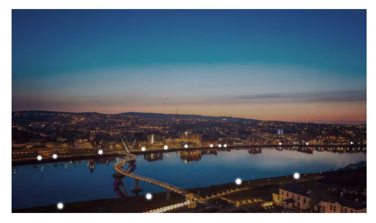
Figure 2. 'Bubbles' as beacons in night mode

In addition to the specific activities within the pods, an important function of the 'Bubbles' is to increase the presence of people in the immediate area, and thus improve the sense of life, positivity and community cohesion of the space by bringing people together. The local district council is looking at an alternative education programme in which the hardest to reach youths within the community have the opportunity to learn and develop business skills among the enterprises that occupy the pods. The portability of the pods is key to their success as they are able to respond to identified negative areas on the riverfront, and thus accommodate the changing needs of the local environment and community. Working in tandem with the local city CCTV initiative, the pods can be placed in areas with poor footfall or illuminate to become cultural beacons when not in use at night (figure 2). During these hours, the illuminated pods can light up areas associated with anti-social behaviour (or areas with low lighting), aid statutory services and provide spaces for people at point of crisis.