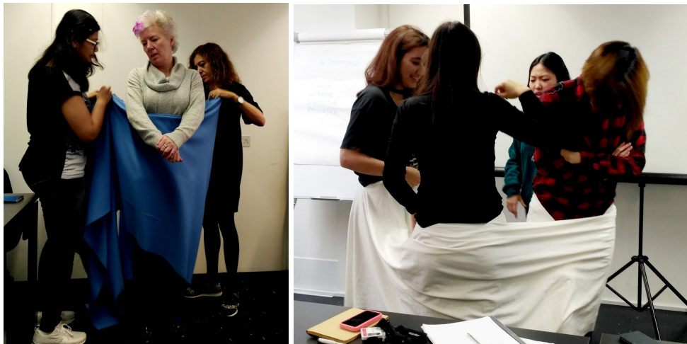
Fig.03 Interdisciplinary teams collaborate in the one of the workshops

As open ended form of investigation research can destabilise the individual's confidence and build insecurity, in particular in an interdisciplinary environment; this is something to tackle and take into account to avoid demotivation and frustration. The group dynamics are something to observe too, in terms of the roles and positions individuals take in a "neutral" field, whether this "neutral" field exists or it is something that facilitates leadership. One of the insights gained so far indicates that personal motivation, engagement and trust on the process are qualities that help students take risks, once they become familiar with the feeling of unsettlement. I observed that students find the group the supporting reference that helps navigate tensions, even though the group behaves also as source of tension that, if not properly tackled, is perceived as obstacle. Even though group members recognise the creative value of the group, which instills motivation, this plays to be one of the most difficult spaces to manage diversity. On one hand the group helps students build resilience towards collaboration and trust on the bigger picture that overcomes insecurity and contrasts; on the other hand the group builds frustration and endemic contrasts embedded in diverse approaches. This aspect is a challenge that could be tackled through transparent leadership based on trust and personal responsibility towards the group.