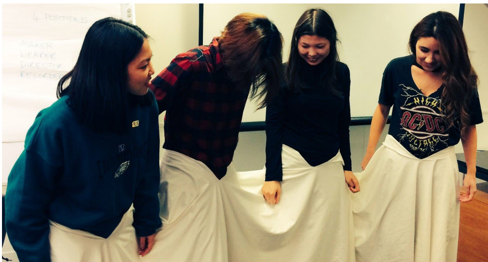
Fig.02 Interdisciplinary teams sharing ideas through the workshop outcome