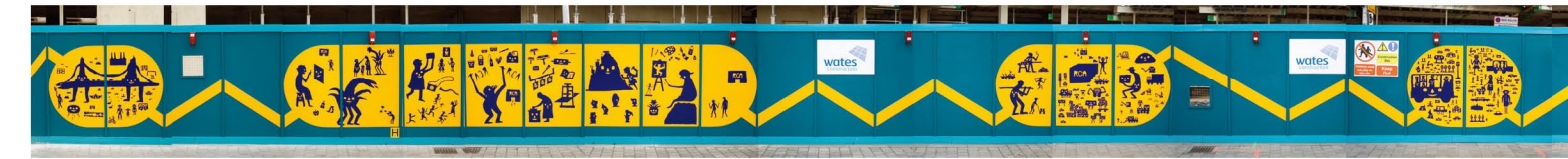
Better see Battersea 2010 screen printed mural 200cm x 3300cm Royal College of Art Howie Street, Battersea