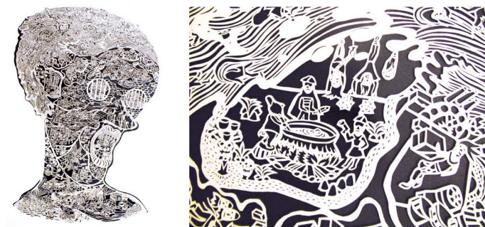
Future head 2007 papercut 84cm x 59cm

Chan revels in the ambiguity of images in endless recombination. Viewing an early work Future head (2007), zooming closer and closer into a papercut face, you instead get further away from the individual and more towards the conditions of the wider world. The head is crowded with ghosts and aliens living among people as they go about their everyday lives. The Stressful city ink drawings also teem with comic incident: a shocked and excited population is devoured by the city they also consume, fuelled by Jamie's pies and Anabolic steroids . The density of these cityscapes possibly echoes the density of Hong Kong, Chan's birthplace and home. While Londoners tend to think of their home as crowded, a recent visitor from Hong Kong said it must be lovely to be in such a spacious city as we looked over the dense rooftops of Hammersmith.