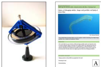
Example of Random image (left) and Bio-inspired card (right)