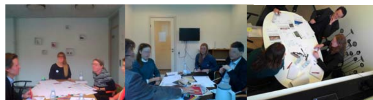
Stills from three of the groups participating in the study.