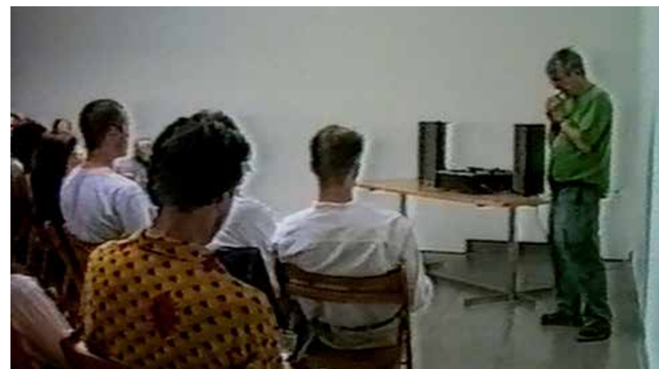
Dan Graham, Lax / Relax (1969–1995). VHS colour video. Courtesy Lisson Gallery, London/New York. © Dan Graham.