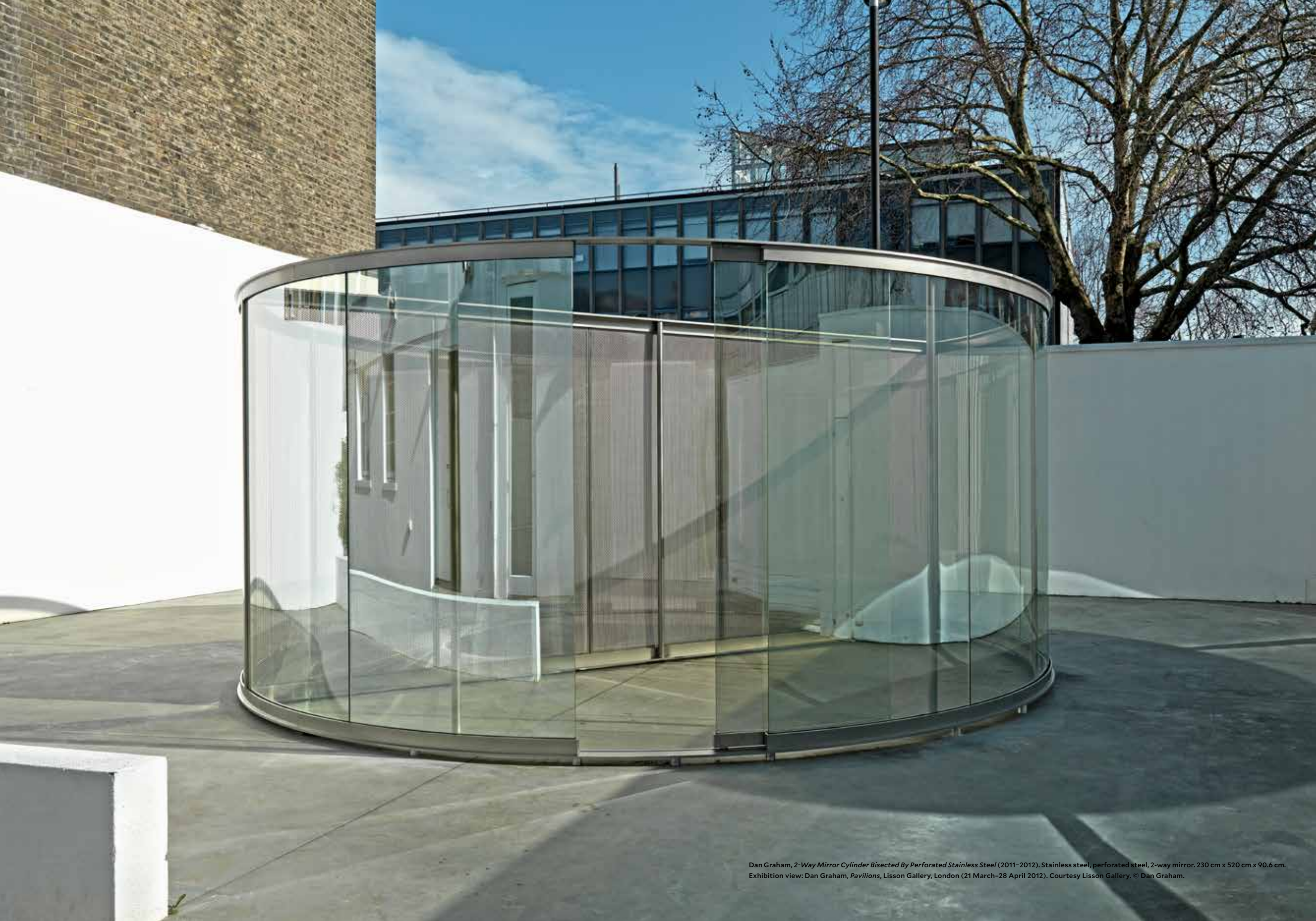
Dan Graham, 2-Way Mirror Cylinder Bisected By Perforated Stainless Steel (2011–2012). Stainless steel, perforated steel, 2-way mirror. 230 cm x 520 cm x 90.6 cm. Exhibition view: Dan Graham, Pavilions , Lisson Gallery, London (21 March–28 April 2012). Courtesy Lisson Gallery. © Dan Graham.