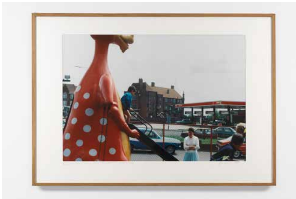
Dan Graham, Kids Playing in Playground in Front... (1984). Cibachrome. 130.5 x 160.5 cm. Courtesy Lisson Gallery, London/New York. © Dan Graham.