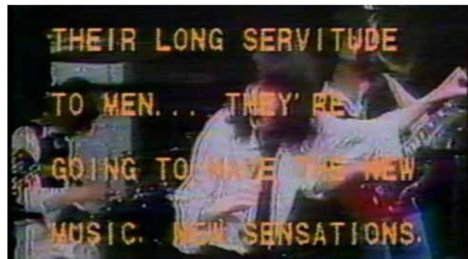
Dan Graham, Rock My Religion (1982–1984). Single-channel video tape, black and white and colour, stereo sound. 55 min 27 sec. Courtesy Lisson Gallery, London/New York.