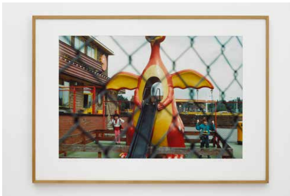
Dan Graham, Kids Playing in Playground in Front... (1984). Cibachrome. 130.5 x 160.5 cm. Courtesy Lisson Gallery, London/New York. © Dan Graham.