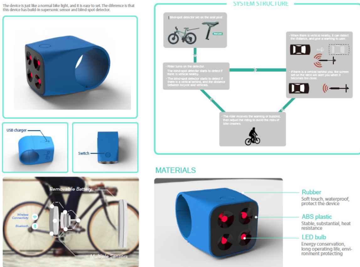
Fig. 2 Design concept of the ‘Smart-bike’ project (sample assignment from Nanan Jia- 2014)

evidence (pictures and text), which is meant to communicate the essential nature of the user experiences or ritual. The ideal experience board has highly relevant observations and insights of user behaviour and actions, as well as ‘painting a picture’ of the experience itself. Fig. 2 shows how the conceptual system produced by a student taking the TIDE module works. This assignment is included simply to illustrate some of the significant novel processes to design a system to prevent bike accidents. The proposed product and system is the result of the user’s behavior needs. Therefore the above-mentioned contextual analysis outputs could provide great support to this design outcome, rather than presented as empirical research evidence.