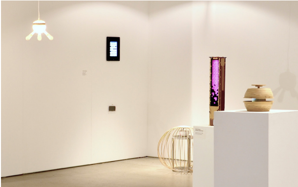
Figure 4. Figure Digital Bamboo Exhibition UNSW Art & Design