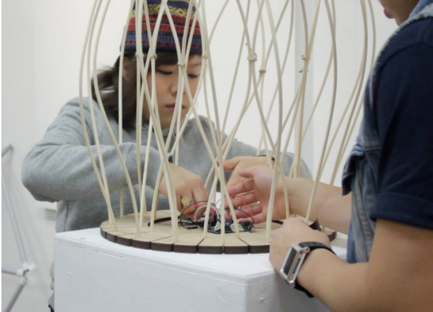
Figure 2. Fitting electronics to a prototype, Feral Experimental Workshop, UNSW.

The final Digital Bamboo Studio , a 2 week intensive course at ITB Indonesia during September 2014, redirected the challenge, asking students to conceive furniture, lighting and related objects that engaged Indonesian people at a personal and interpersonal level. Informed by field trips and intensive workshops, the students worked small teams, responding to the theme of 'security' - what it meant for Indonesians and Australians in 2014. Their designs needed to employ components and processes appropriate to village bamboo craft, plus digital visualisation, 3D printing and laser cutting services available in Bandung. Three types of bamboo craft specialisations of the Tasikmalayan area were introduced : soft, delicate weaving used for flexible structures, bamboo bending methods used to create utensils and bird cages, and the more rigid common weaving used for containers and walls. Designs were to be hand assembled and could utilise open source physical computing code and electronic components. Students were asked to focus on developing objects that materially expressed functional and aesthetic narratives framed by their own cultural and technical exchange.