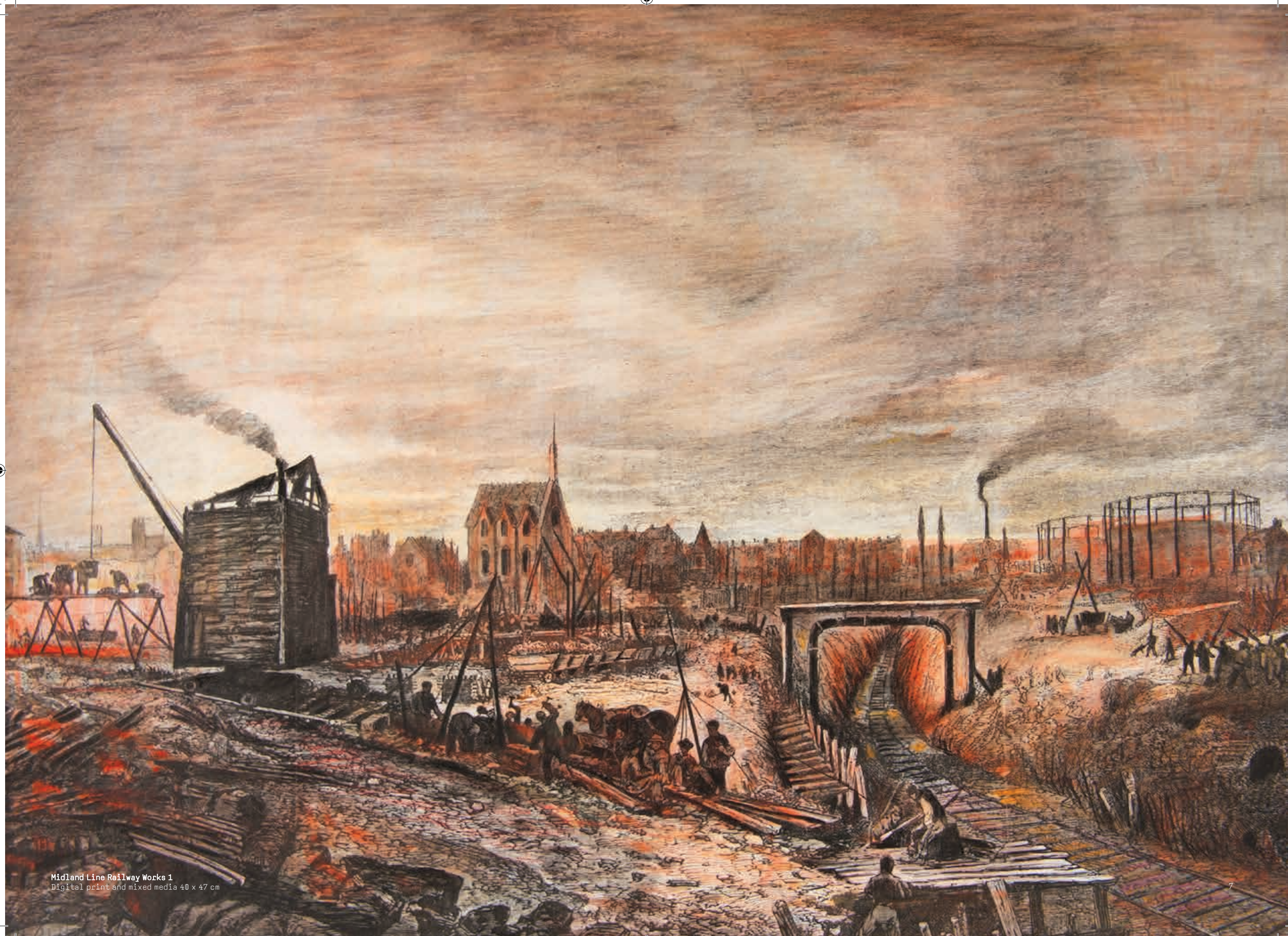
Midland Line Railway Works 1 Digital print and mixed media 40 x 47 cm