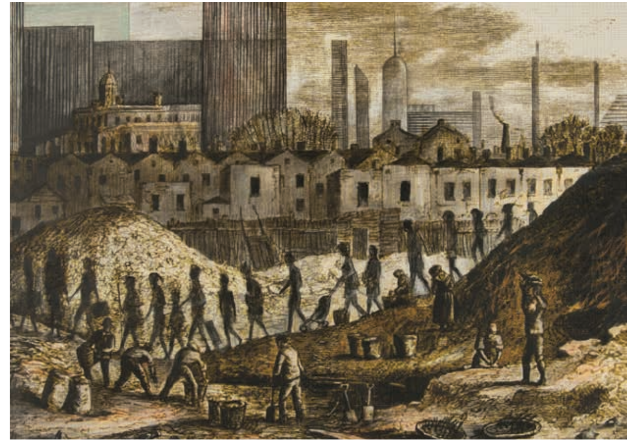
Dust Heap Digital print and conte 39 cm x 52 cm