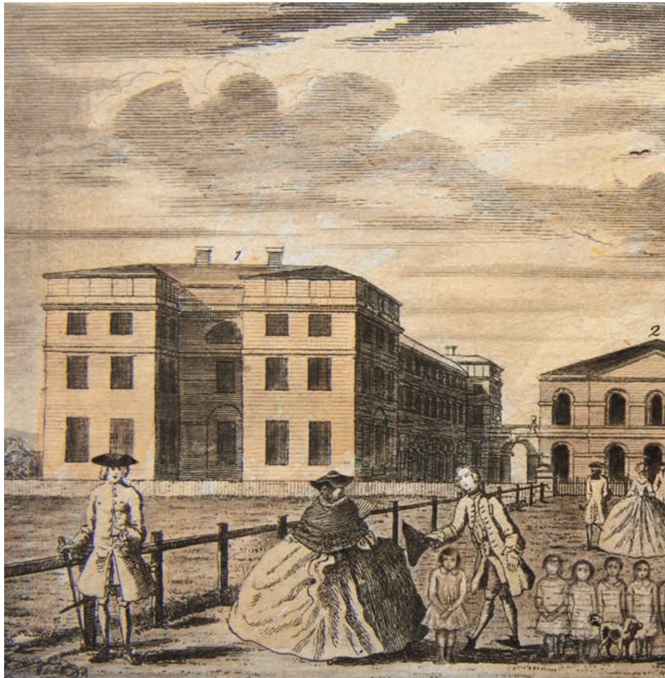
Foundling Hospital Digital print, conte and gouache 28 cm x 55 cm