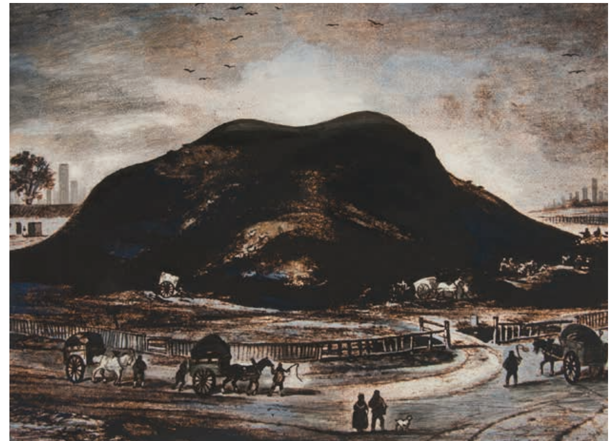
Dust Heap 1836 Digital print and conte 38 cm x 50 cm