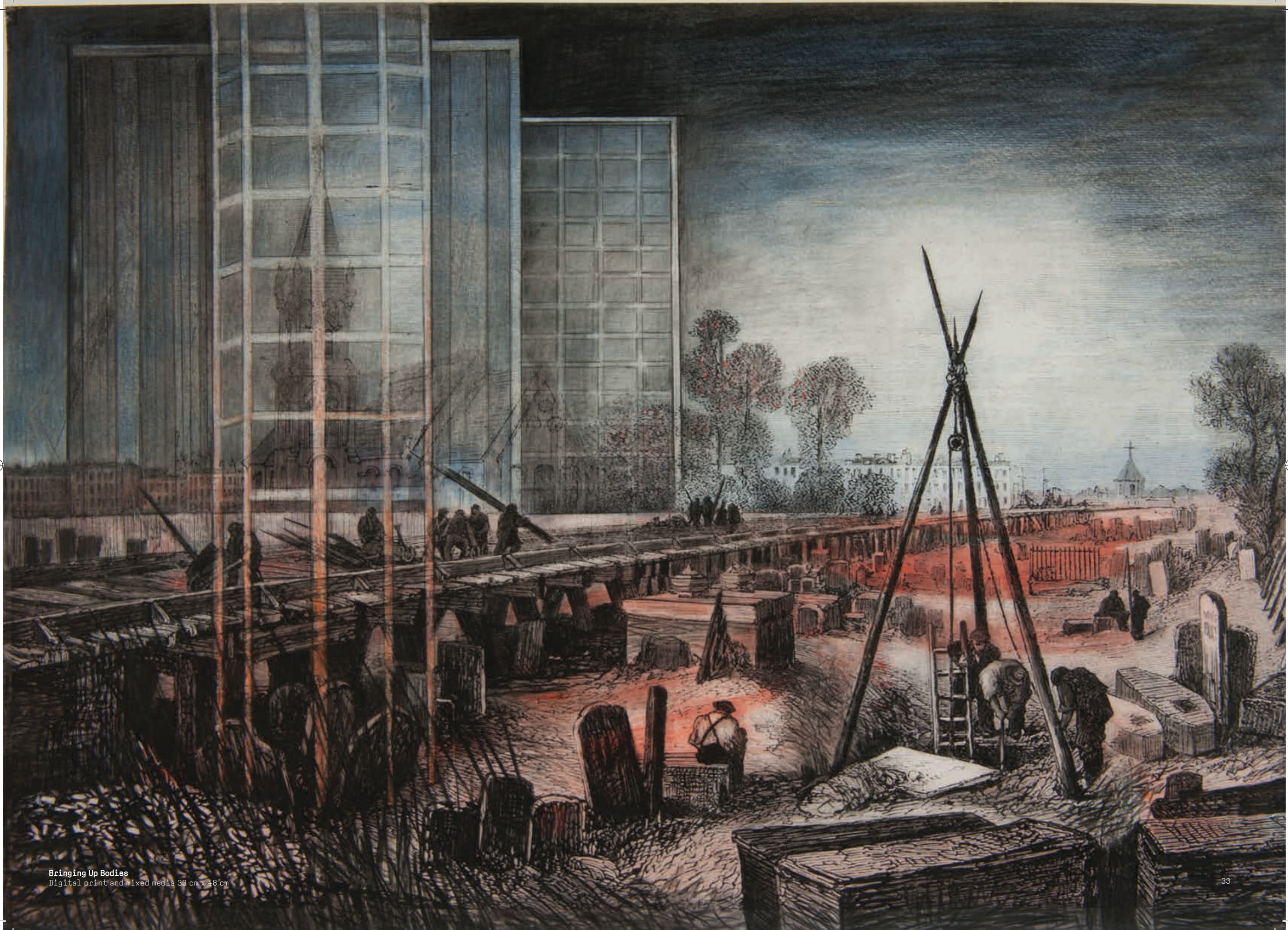
Bringing Up Bodies Digital print and mixed media 33 cm x 48 cm