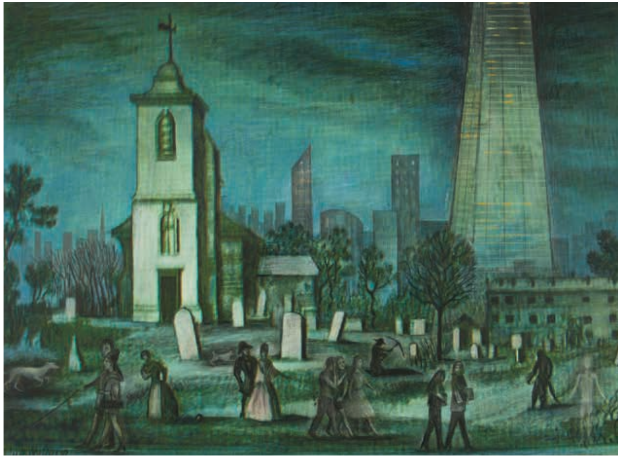
Celebrations of the Dead Digital print and mixed media 41 cm x 55 cm