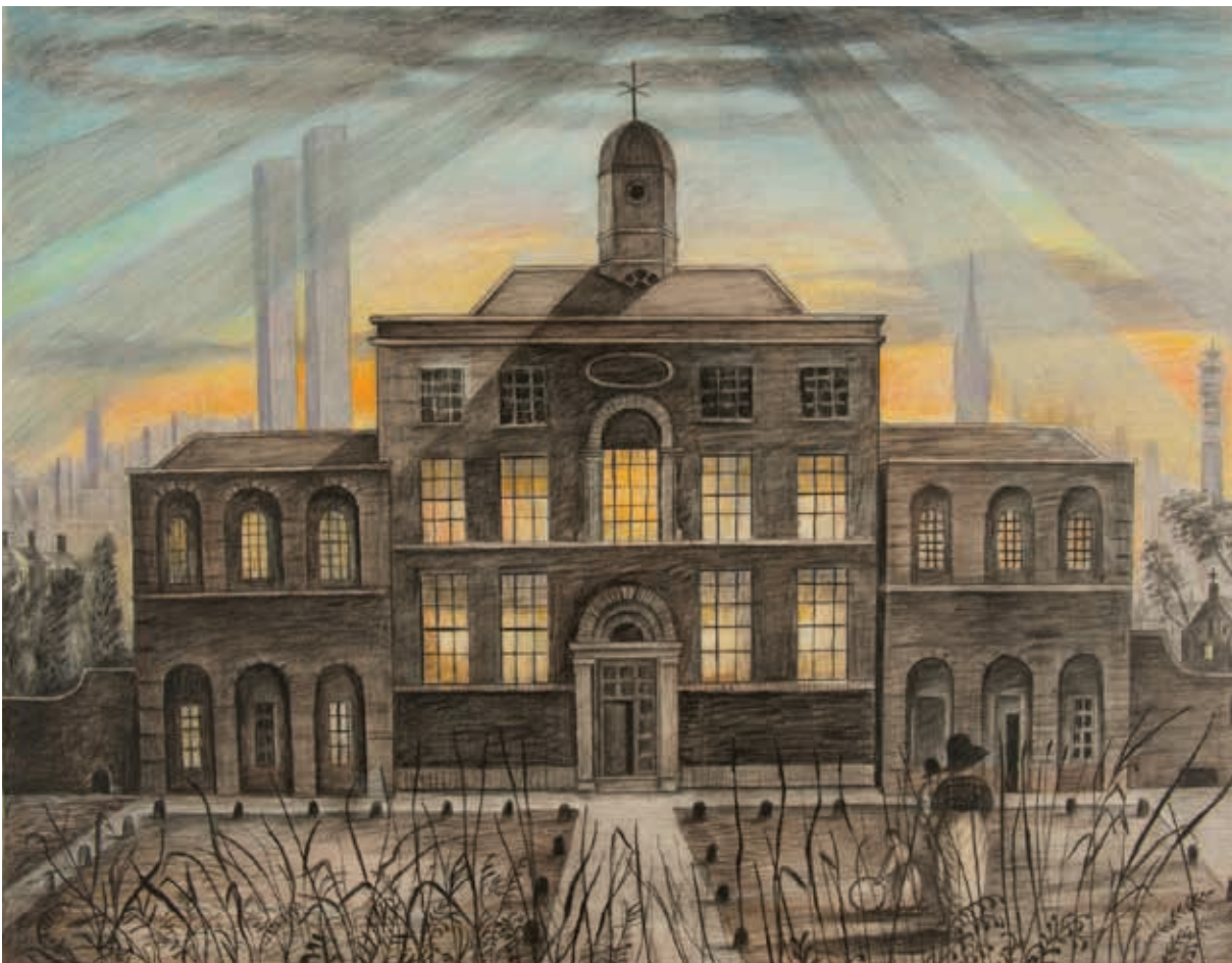
King's Cross and the Smallpox Hospital Gouache and mixed media 65 cm x 42 cm