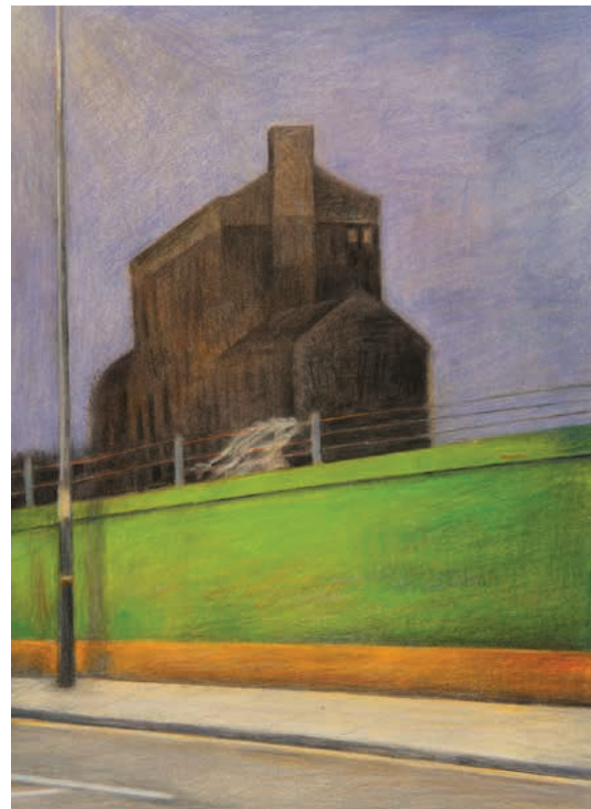
Coal and Fish Crayon and gouache 33 cm x 26 cm

is essential to their artistic and narrative success. If the works looked too much like a collage then the story they tell would probably not be greater than the sum of their parts. But this is not the case. The seamless assemblages invariably take the retained and added detail to a new level. With these images - that are commentaries on the London that was, is and will be - Howeson joins that intriguing band of artists who have not only chronicled London life but through their work added to our understanding and appreciation of the city. Sometimes these works are visionary, sometimes satiric but nearly always cautionary. As with Hogarth, Blake and Cruikshank, Howeson's works have compelling stories to tell.