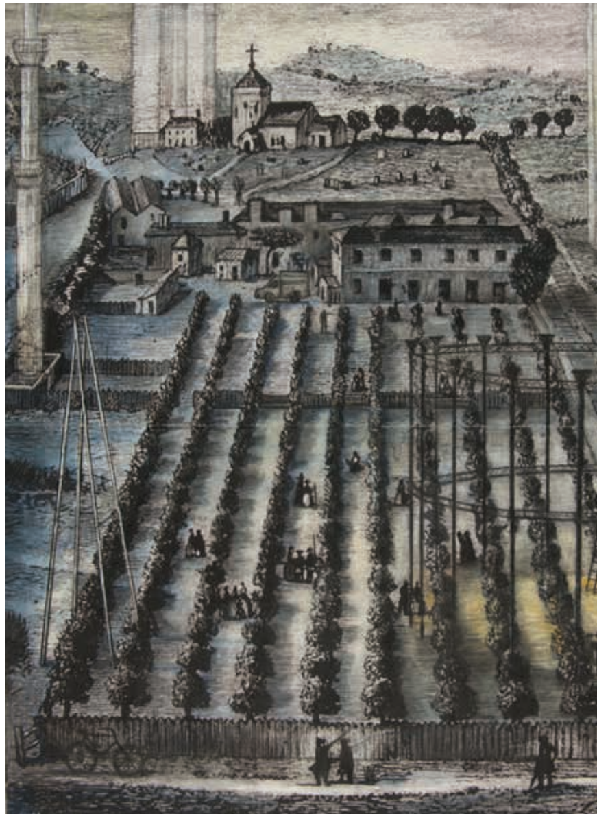
St Pancras Wells Digital print and mixed media 46 cm x 38 cm