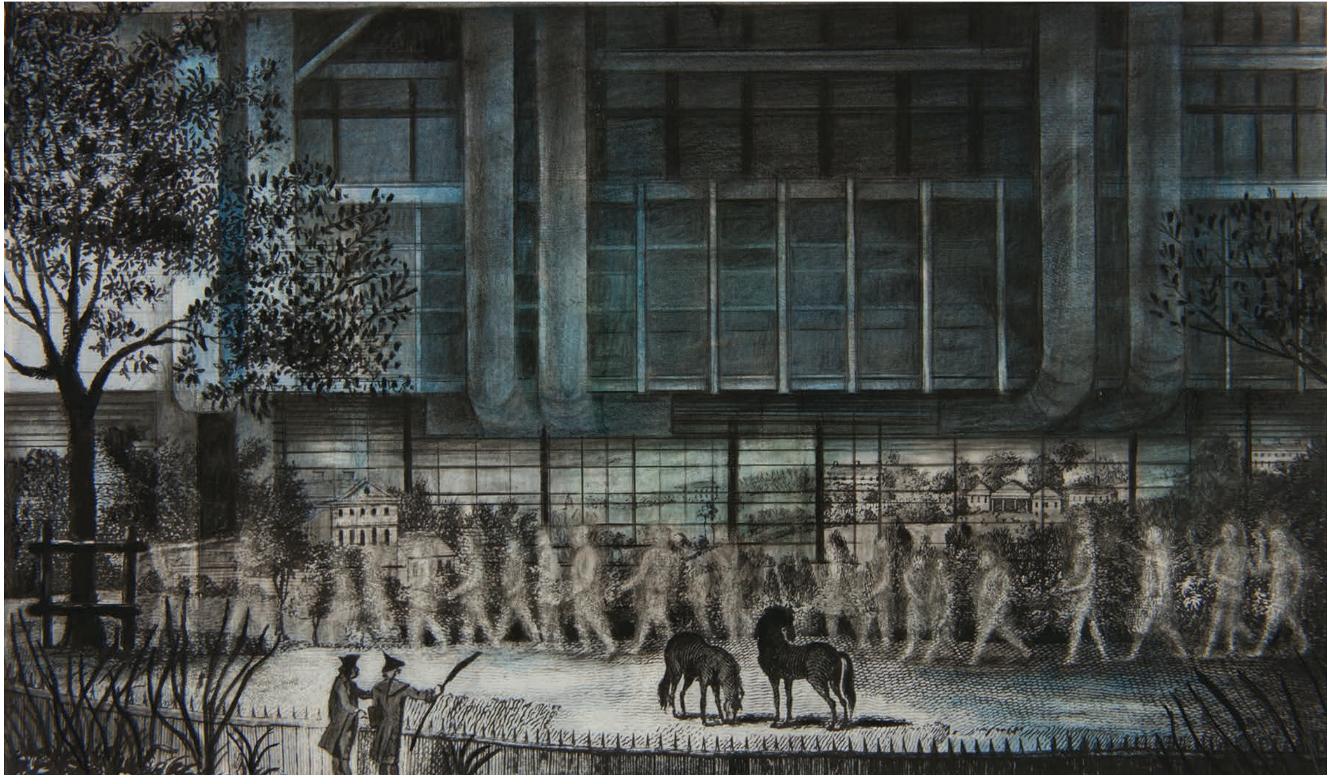
Hampstead Horses Digital print, conte and crayon 28 cm x 46 cm