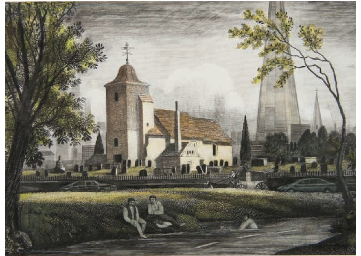
St Pancras Old Church and the Fleet River Digital print and mixed media 32 cm x 47cm