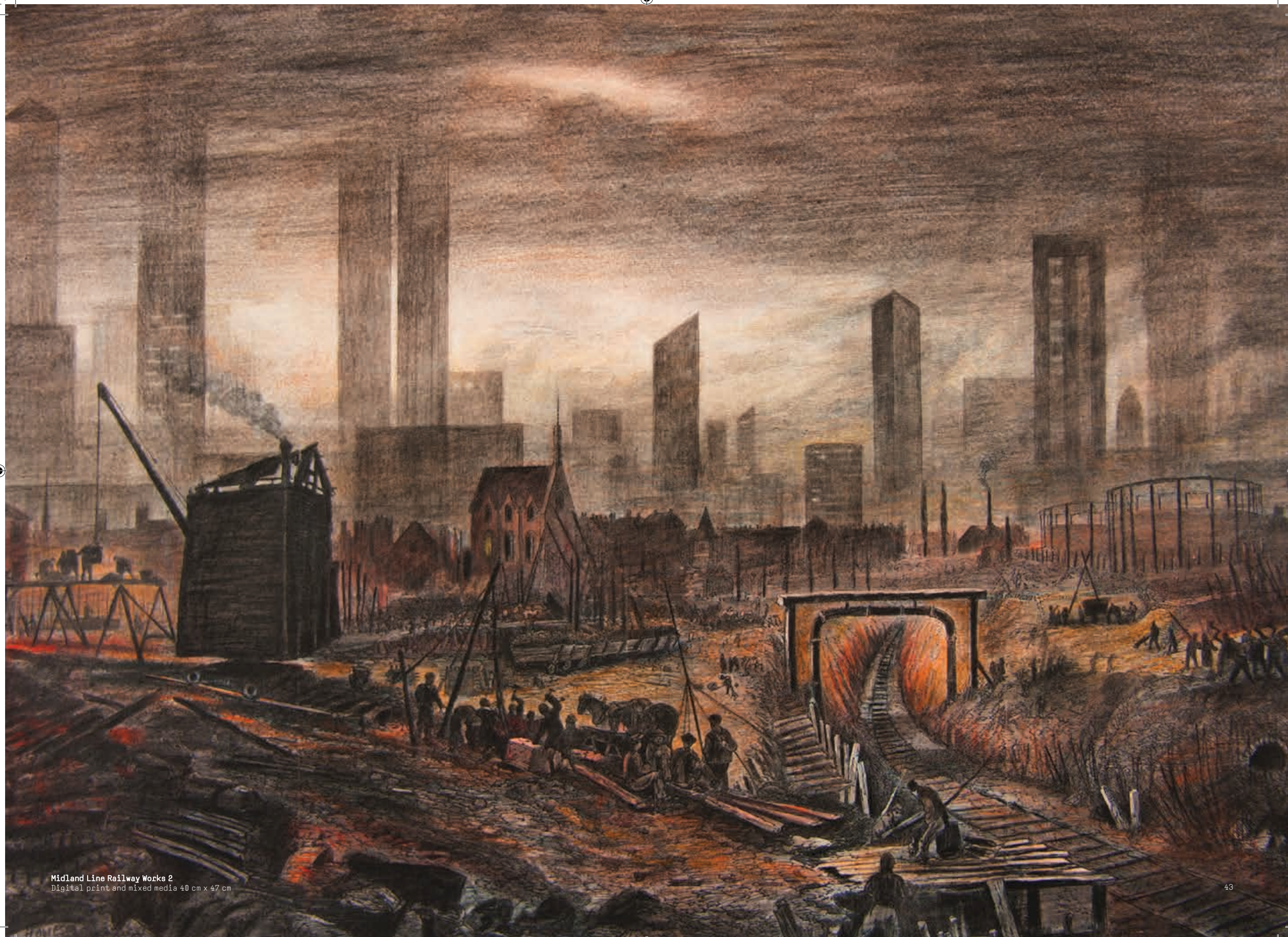
Midland Line Railway Works 2 Digital print and mixed media 40 cm x 47 cm