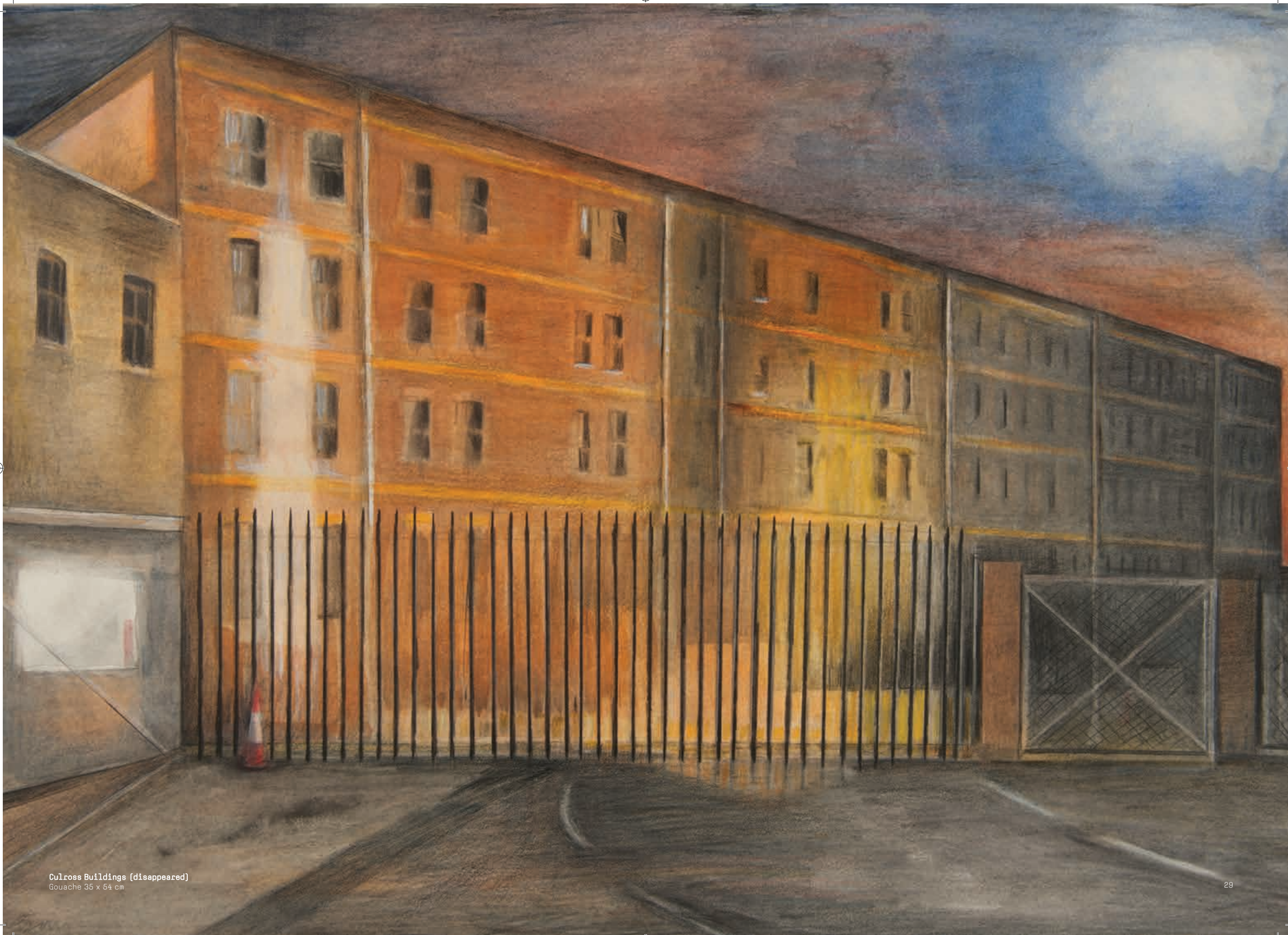
Culross Buildings [disappeared] Gouache 35 x 54 cm