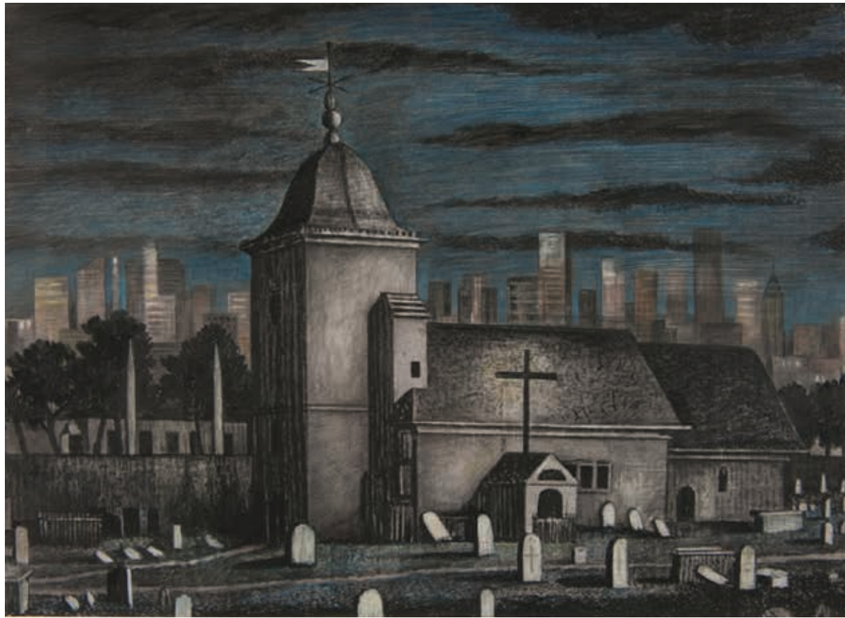
St Pancras Churchyard at Night Digital print and mixed media 32 cm x 45 cm