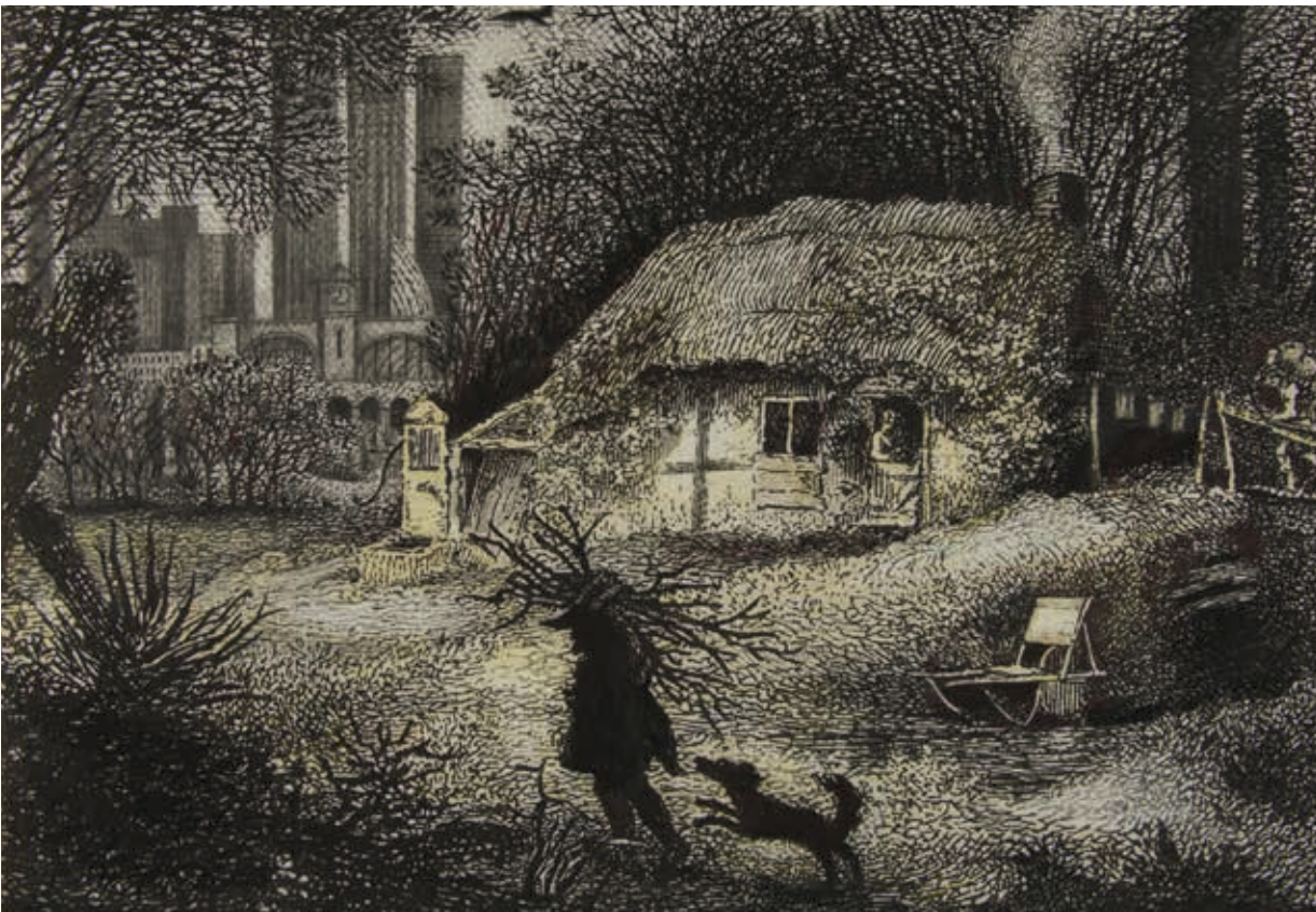
Battlebridge 1797 Digital print and carbon 42 cm x 56 cm