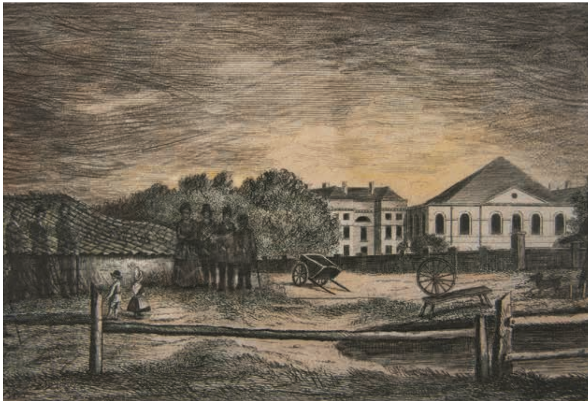
St Pancras Fortifications 1642 Digital print, conte and gouache 42 cm x 53 cm