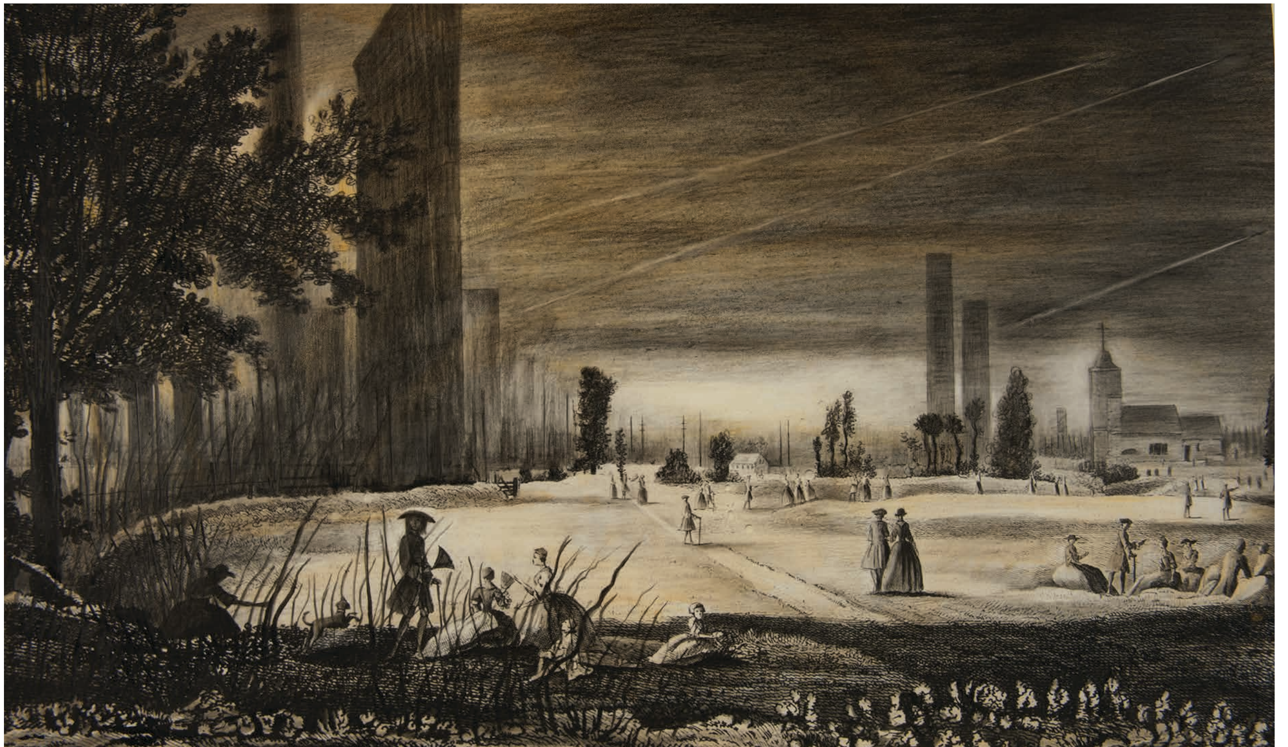
St Pancras in the Fields 1762 Digital print, gouache and carbon 36 cm x 57 cm