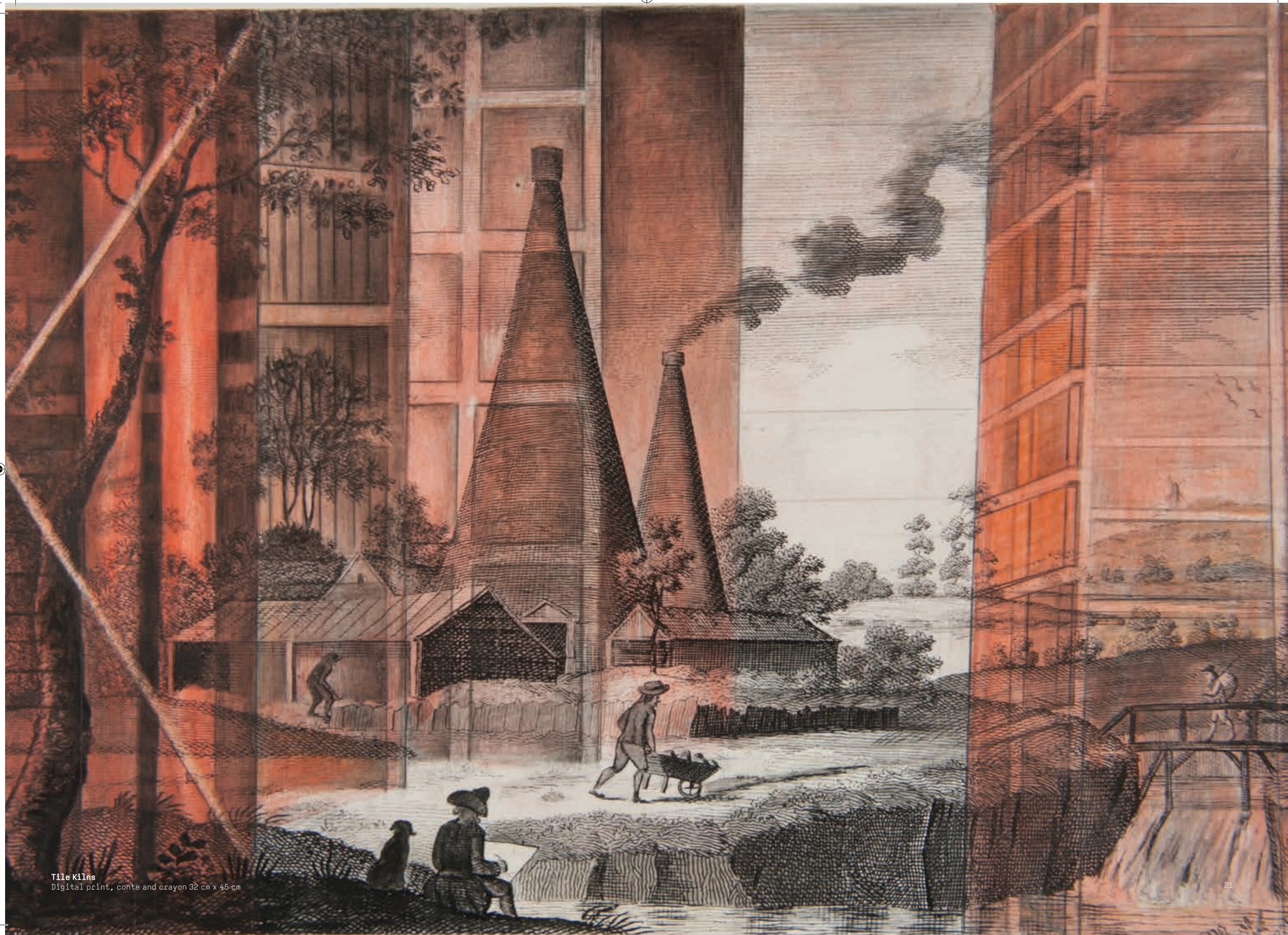
Tile Kilns Digital print, conte and crayon 32 cm x 45 cm