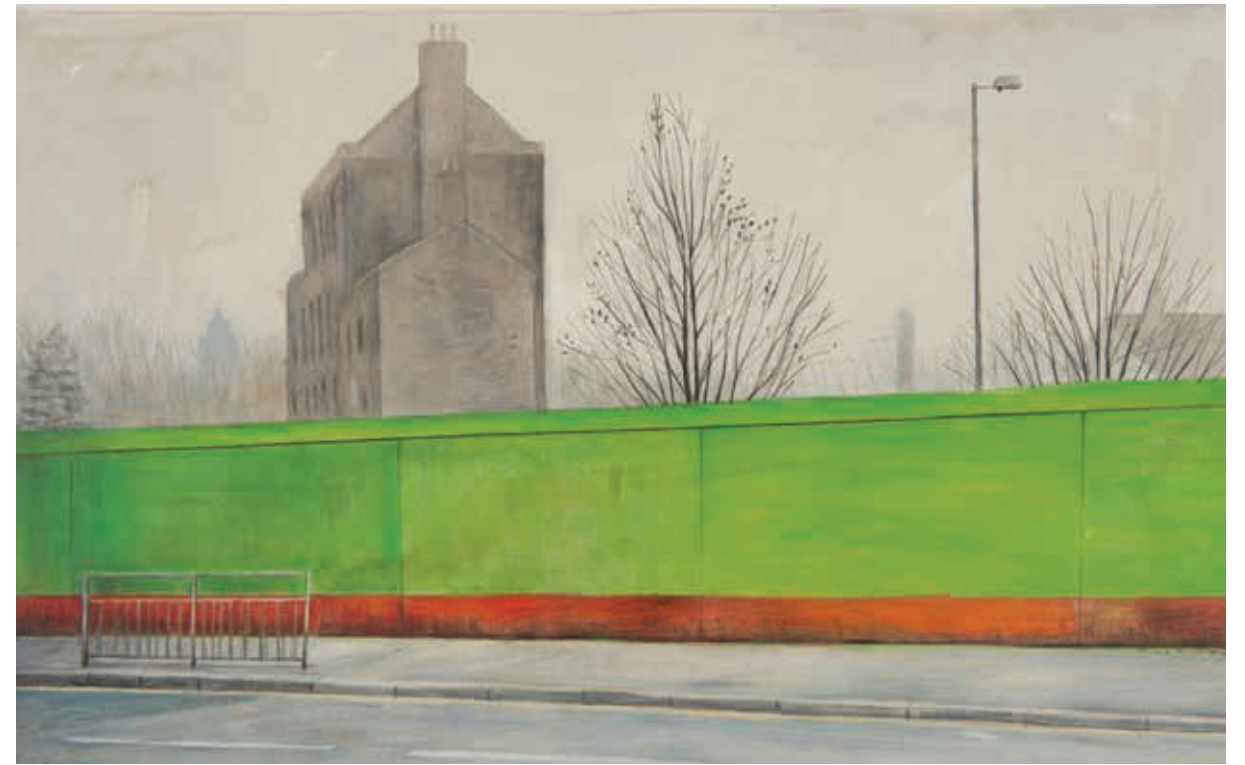
Coal and Fish Hoardings Crayon and gouache 28 cm x 45 cm