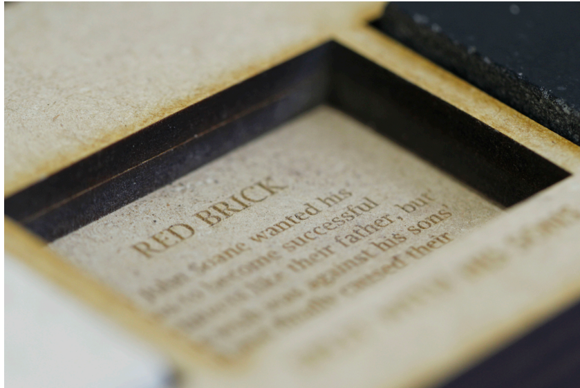
Figure 02. A story revealed beneath a piece of brick , 2014

The piece uses materials relevant to different periods of Sir John Soane's life, as follows: