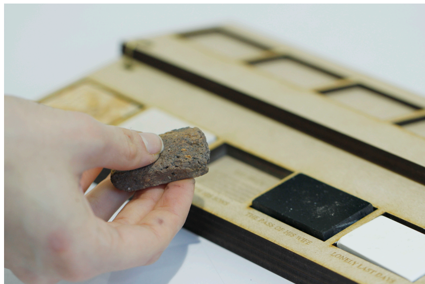
Figure 01. A visitor holding a piece of brick, 2014