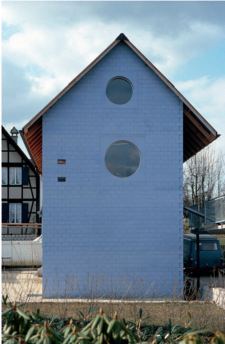
Herzog & de Meuron, Blue House. © 2014, Herzog & de Meuron