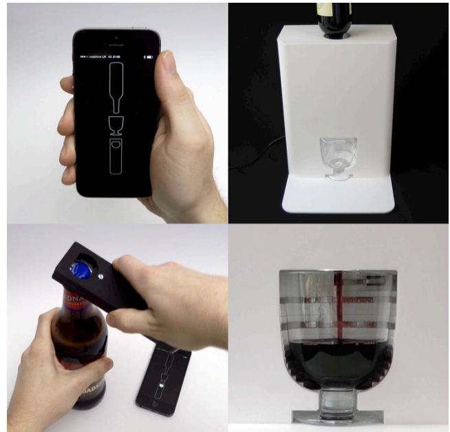
Figure 2 Interactions of Drinking Together Whilst Apart

The design of the bottle opener had to mechanically remove a bottle top without itself breaking with the forces involved. The teeth from a novelty electronic opener were used around which a new device was built. We were aware that this device would operate in public and be taken on public transport, including flights. As such we wanted to ensure that it would not be read as a piece of DIY technology and arouse suspicion. The case was carefully constructed, with the electronics built on a professionally produced PCB and easily inspectable, with a switch for airplane mode . The bottle opener contains a Bluetooth 4.0 module, it senses the presence of a bottle top in its teeth by conduction.