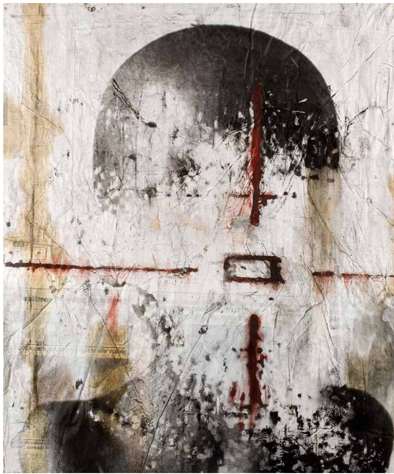
Top: Civilians 4, 2008.

PK The vitrine containing the archive materials is precisely about the process of getting the work out into the world, to as many people as possible, in a form that is available freely or