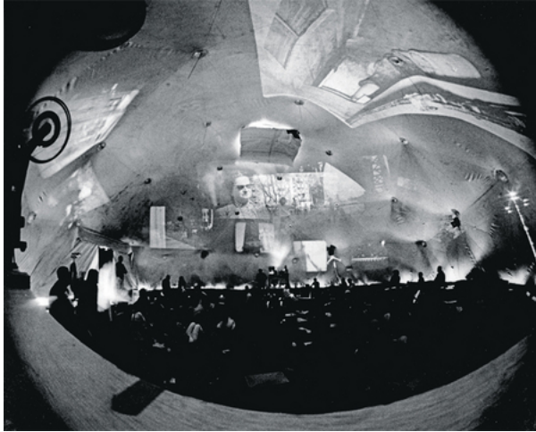
Stan VanDerBeek, Movie-Drome , 1963–65. Performance view, Stony Point, NY, ca. 1965.

There are at least two ways to approach this re-presentation. One is to see it first and foremost as a form of historical reenactment, as an index that points back to the work in its original context while acknowledging the impossibility of true repetition. In short, from this perspective, the reenactment offers an opportunity for a richer encounter than documentation can provide. But the sold-out performance of Abstract Film No. 2 also possessed a contemporaneity that stemmed not merely from its status as an ostensibly new work (the artist's second abstract film, not a reperformance of her first) but from the antagonistic position it took up in relation to the hegemonic form of twenty-first-century liveness. Within a visual culture predicated on the simultaneous dream and nightmare of perpetually available images circulating across numerous formats and exhibition situations, export opted for the inextricable connection of the artist's body to the work and for that work's ephemeral existence to be bound to a particular place and time.