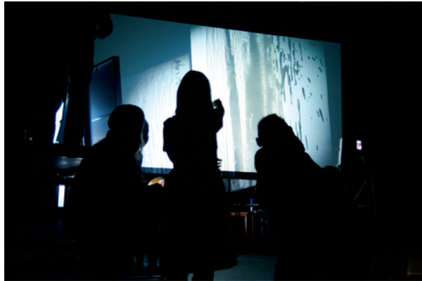
VALIE EXPORT, Abstract Film No. 2 , 2014. Performance view, Kino Europa-Palast, 60th International Short Film Festival Oberhausen, Germany, May 3, 2014.

"LIVE CINEMA" sounds like a contradiction in terms. After all, if liveness is considered in relation to technological media at all, it tends to be thought to be the property of broadcast television and the Internet much more than of cinema, which depends on regulated repetitions of the prerecorded. Televisual "flow," to use cultural critic Raymond Williams's term, gives the impression of a ceaselessly unfolding now, even when the content being transmitted is not in fact live. As film theorist Mary Ann Doane has put it, "The temporal dimension of television . . . would seem to be that of an insistent 'present-ness'—a ' This-is-going-on ' rather than a ' That-has-been ', a celebration of the instantaneous." 1 Web browsing inherits this temporality while exacerbating it through increased interactivity and customization. Not only is content often updated in real time, but the user possesses the ability to navigate through it at his or her volition, thus experiencing the liveness of a self-directed desire. By contrast, though bound to the present-tense unspooling of the film through the projector, cinematic exhibition is more properly located in the domain of the That-has-been . The spectator encounters an already-completed artwork that exists within an economy of the multiple as a copy without original.