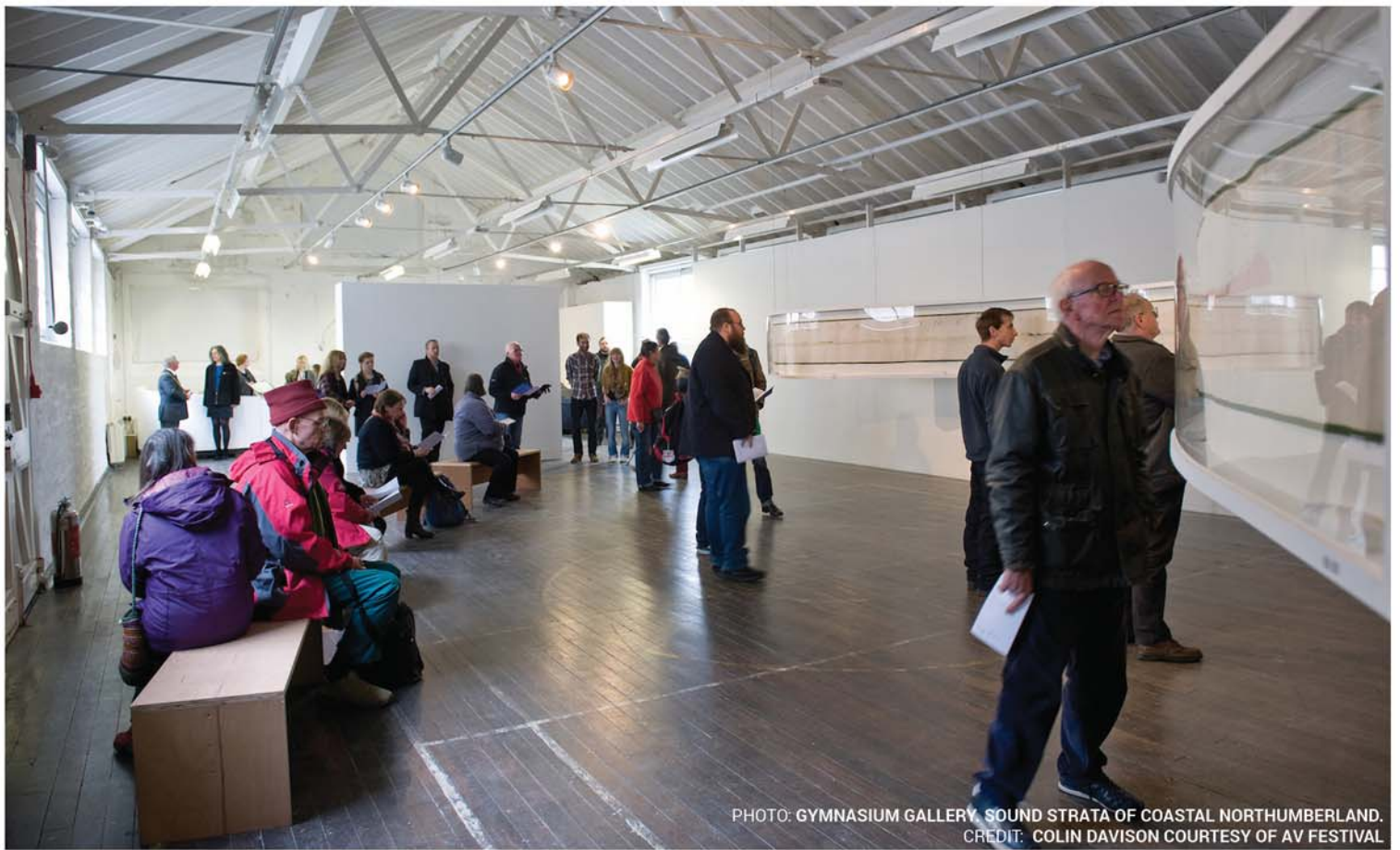
PHOTO: GYMNASIUM GALLERY, SOUND STRATA OF COASTAL NORTHUMBERLAND. CREDIT: COLIN DAVISON COURTESY OF AV FESTIVAL