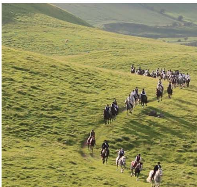
Image: Katie Davies: The Lawes of Marches (Film Still) Commissioned by Berwick Visual Arts for the 10th Berwick Film & Media Arts Festival with support from Arts Council England