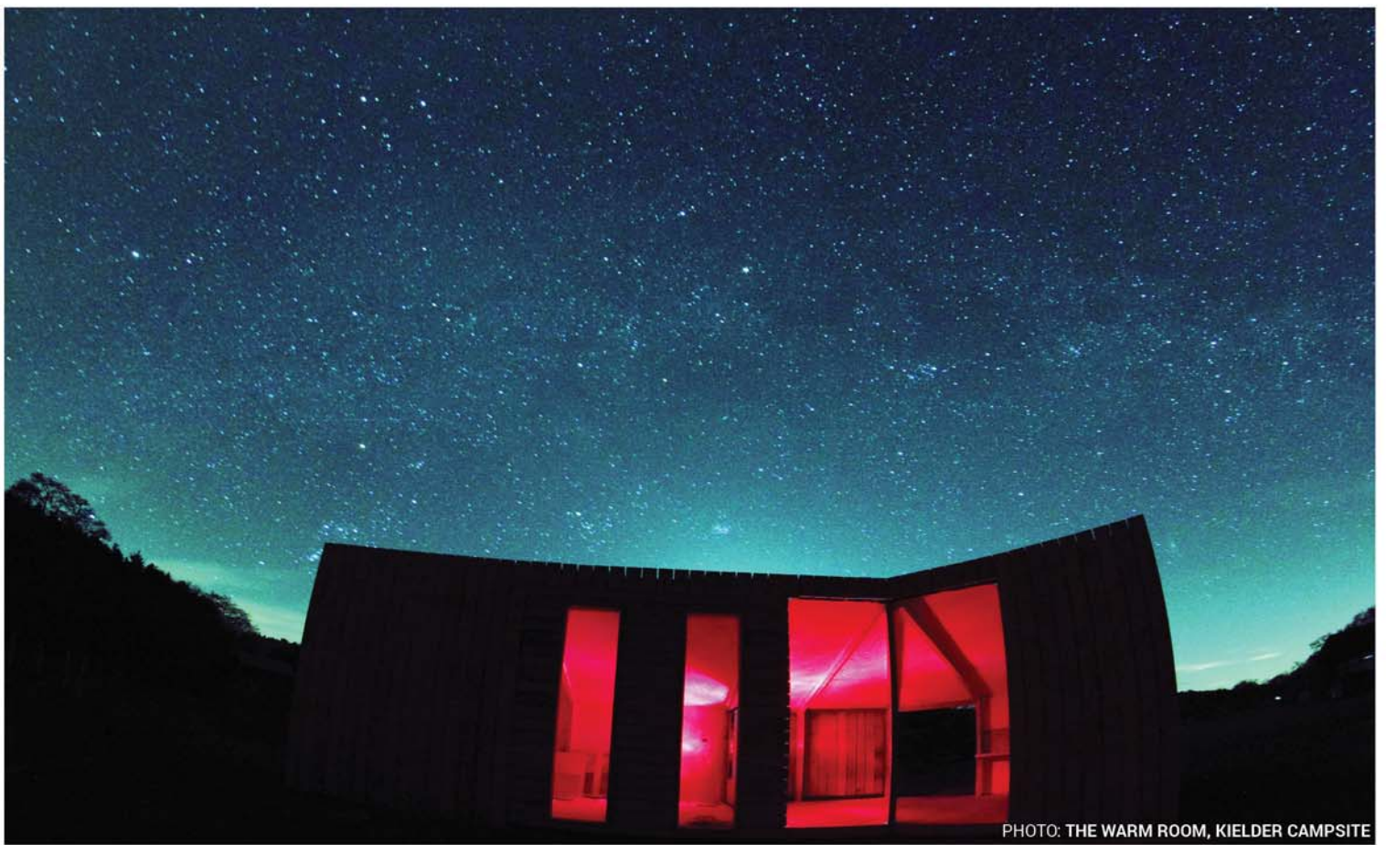
PHOTO: THE WARM ROOM, KIELDER CAMPSITE