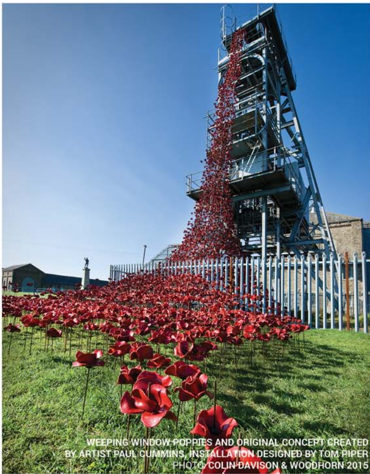
WEeping WINDOW POPPIES AND ORIGINAL CONCEPT CREATED BY ARTIST PAUL CUMMINS, INSTALLATION DESIGNED BY TOM PIPER PHOTO COLIN DAVISON & WOODHORN 2015