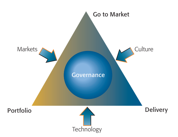
Figure 2 The triple-axis model

Generalizing from the case studies, IBM in particular, we can see that the go-to-market team works with the offering-development team to shape a portfolio of service that reflects its clients' needs and competitive pressures. The delivery organization looks for new tools and techniques that will allow it to improve its productivity and, in its turn, is driven by a combination of this productivity goal coupled