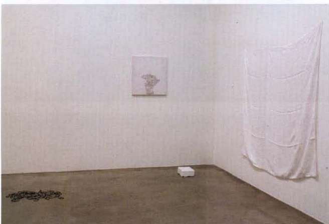
Top: Grey Cloth Project: Glasbaus (detail) 2005 Mixed media Dimensions variable