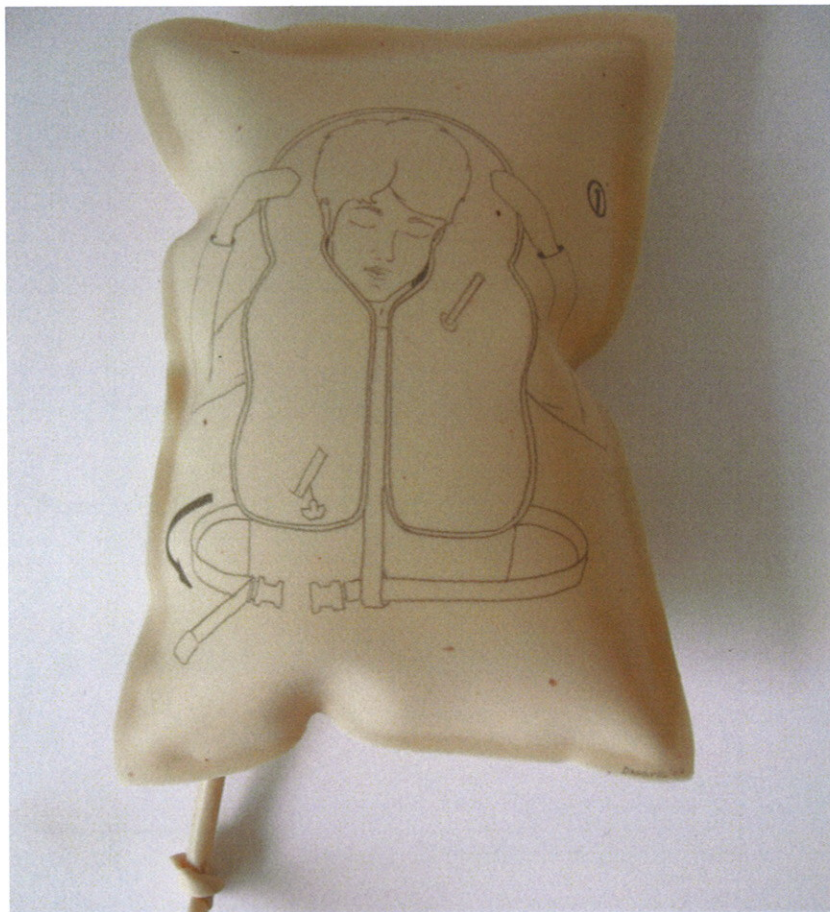
How to use a life vest, 2007, silicone, pigment, graphite, breath

Edith Dakovic's 'Mer-made Products' series is comprised of silicone rubber sculptures and drawings which are cast in a method unique to her work. The surfaces of these rubber 'Hybrids' are canvas or paper-textured but resemble human skin, complete with all its markings - beauty marks, moles with little hairs, etc. These tactile pieces - some of which are inflatable - are sensual and haptic whilst at the same time seemingly cold and clinical. Their hybrid nature can be somewhat disconcerting yet the work remains very alluring.